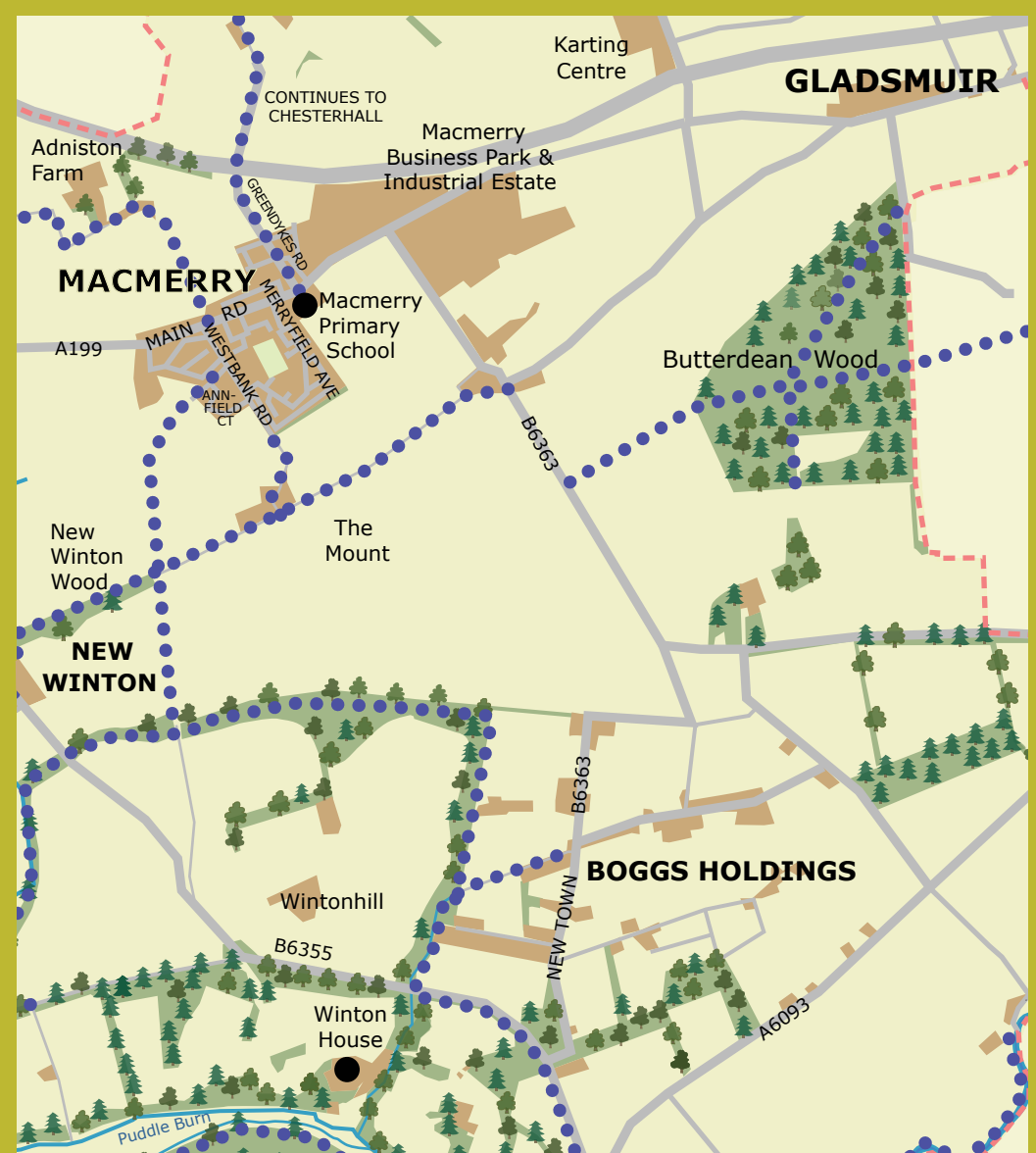
Boggs Holdings & Gladsmuir