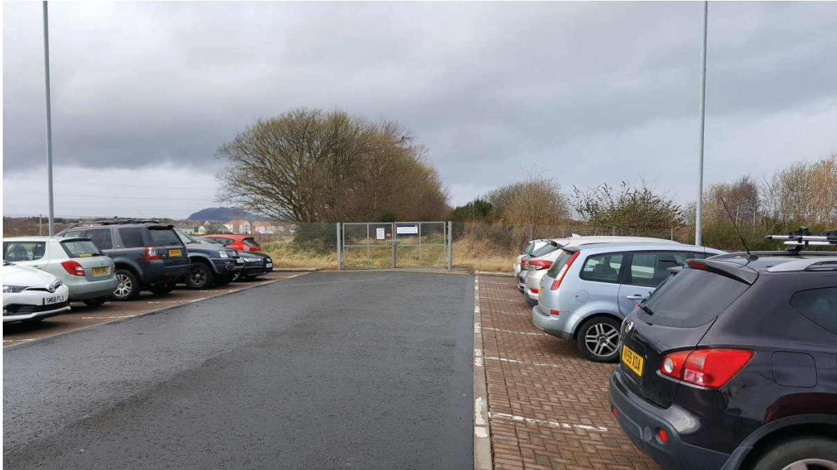
Musselburgh – area for possible car park extension

The most likely area available for a car park extension is to continue the existing car park along the solum of the former Wanton walls lines, on which the existing car parks are built. If this were combined with platform extensions it would limit the walk to an Edinburgh bound train, but it would be a long walk from a train arriving from Edinburgh.