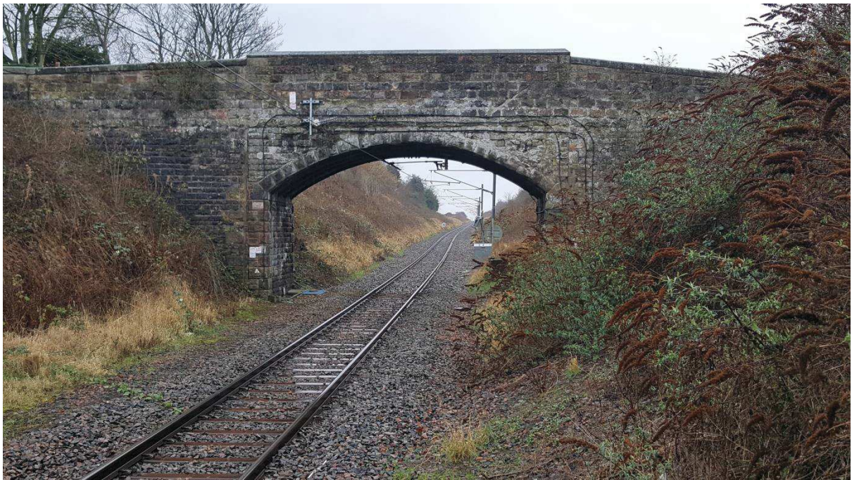
North Berwick - Bridge carrying Ware Road over the railway taken from the end of the platform.