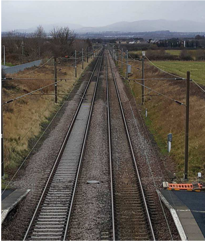
Wallyford – Edinburgh direction.

The track is straight here and there is no signalling equipment along this section of track.