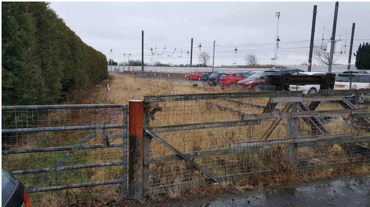
Drem – Redundant siding from the car park looking east.