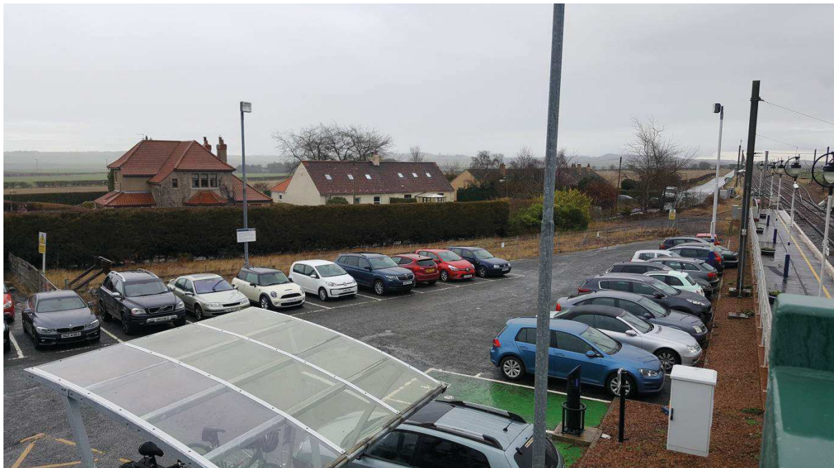
Drem - General view of car park on up side, showing redundant, but still extant siding.

old station. Site choice would be dictated by the configuration of the future network, especially if a new station at is constructed at Haddington and the origins of the current users of Drem station.