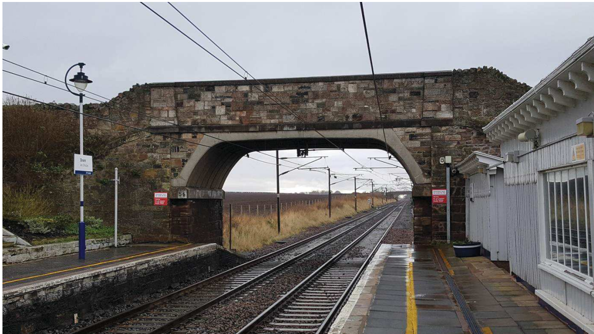
Drem Road overbridge at Edinburgh end of the station