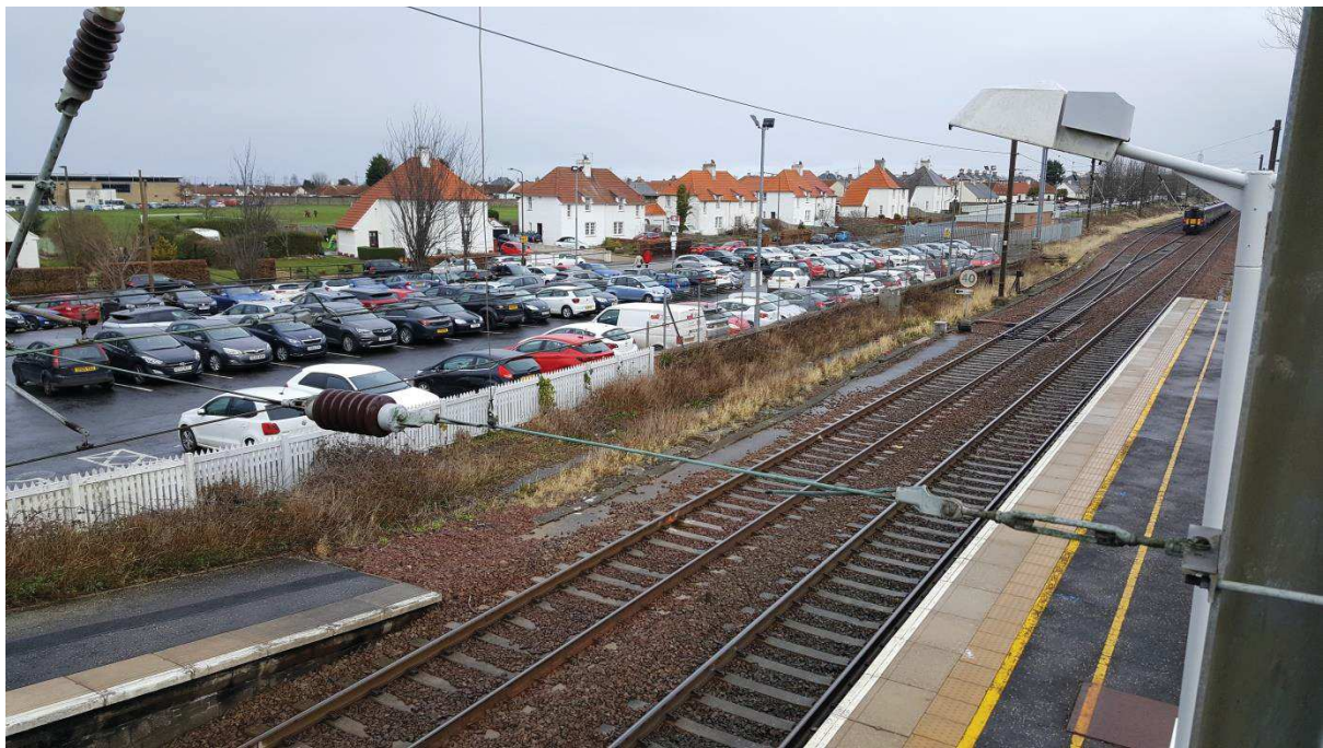
Prestonpans – North Berwick end, including up side car park

The track is straight and there is no signalling equipment in the way, so this seems the better place for the small extension required to accommodate the longest trains, which for 8 car trains may only require the replacement of the ramps with modern fenced flat ends and provide a relatively inexpensive solution.