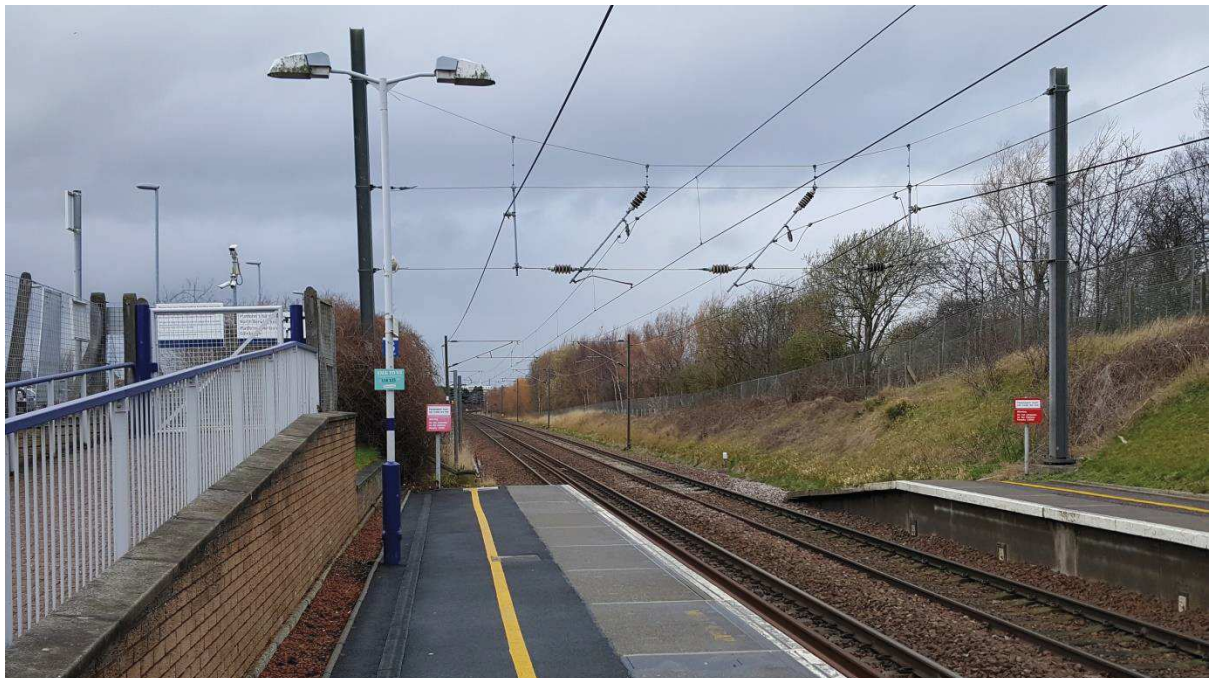
Musselburgh – Edinburgh end of the platforms

The track at the Edinburgh end of the up platform is straight and there is no signalling equipment located in the likely area of any platform extension.