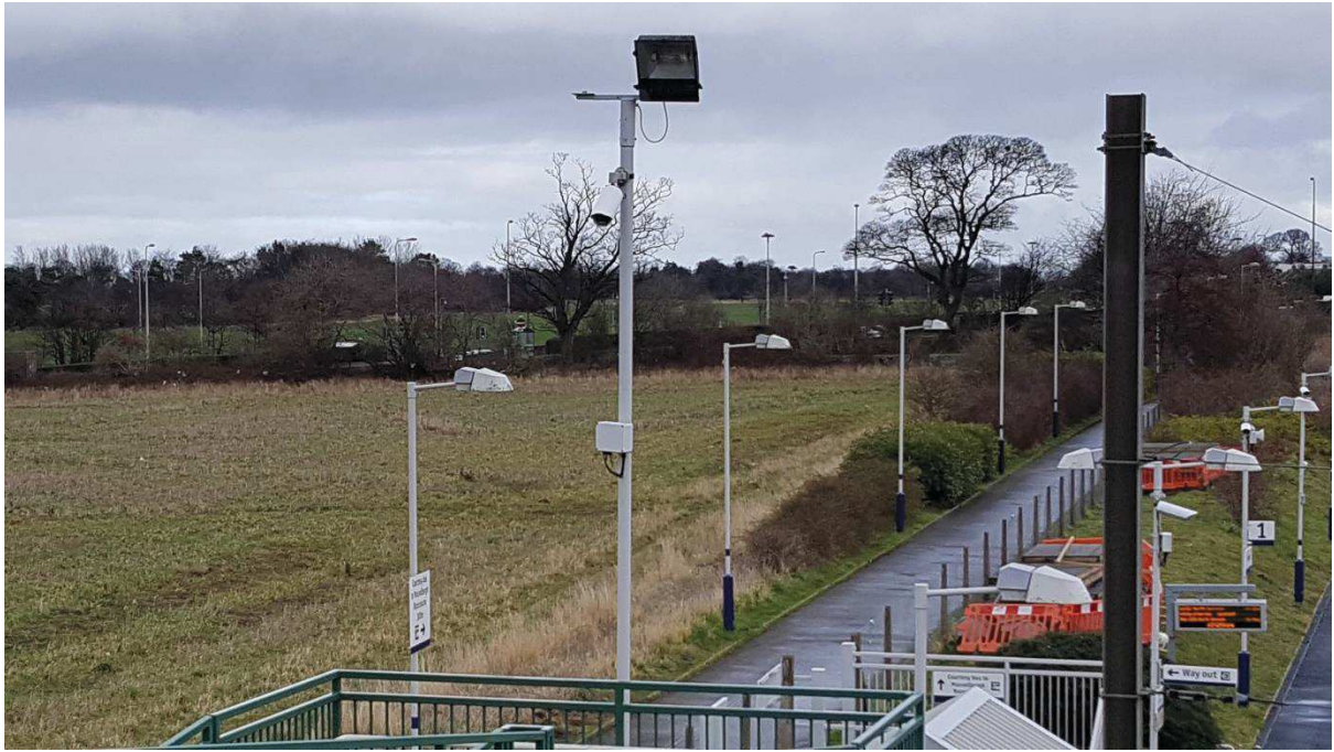
Wallyford – possible new car park site on up side