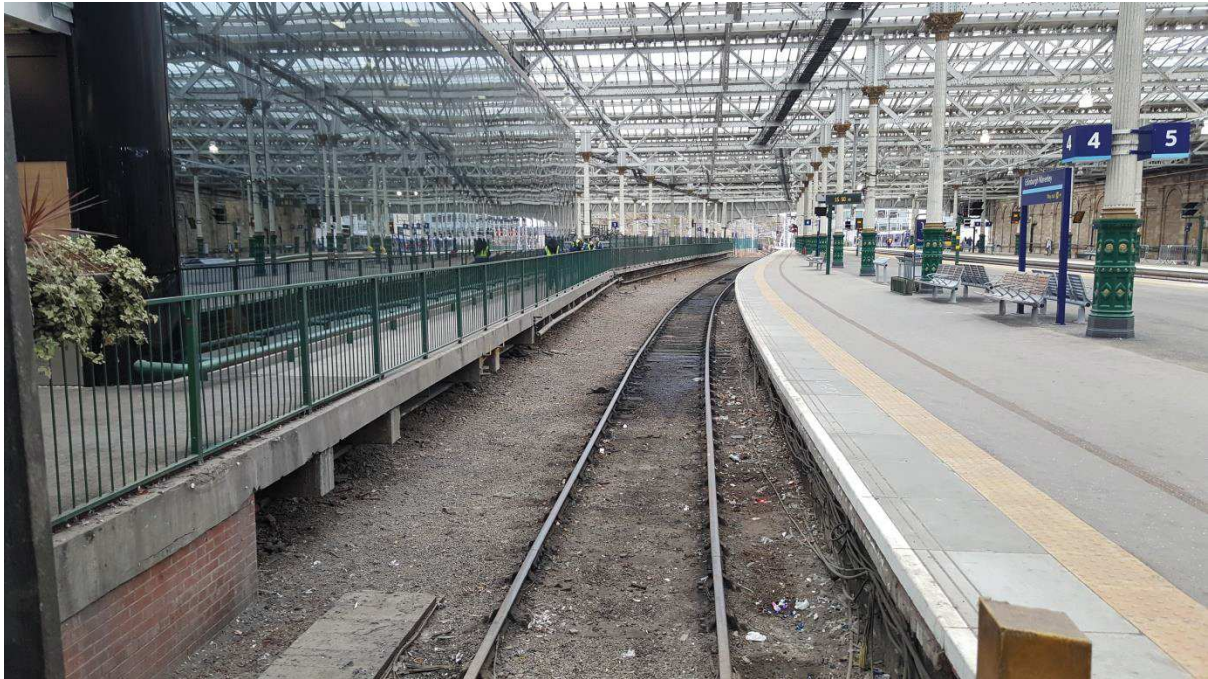
Edinburgh Waverley – Platform 4 viewed from the buffers near the station building

Platform 4 is constrained by the main station building which is only across the former access road from the buffers shown above. It is only 6 metres too short to hold a 9 car train, but by the time the signalling and buffer standbacks and allowance for splitting/joining have been added in this is likely to be more like 20m short. However, it may be possible to squeeze a 9 car train into an extended platform, but this would need to be subject to detailed design.