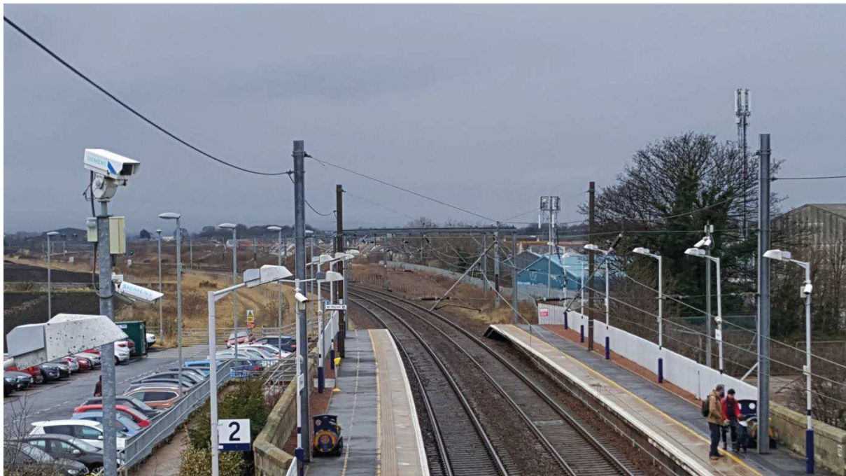
Prestonpans – Edinburgh direction