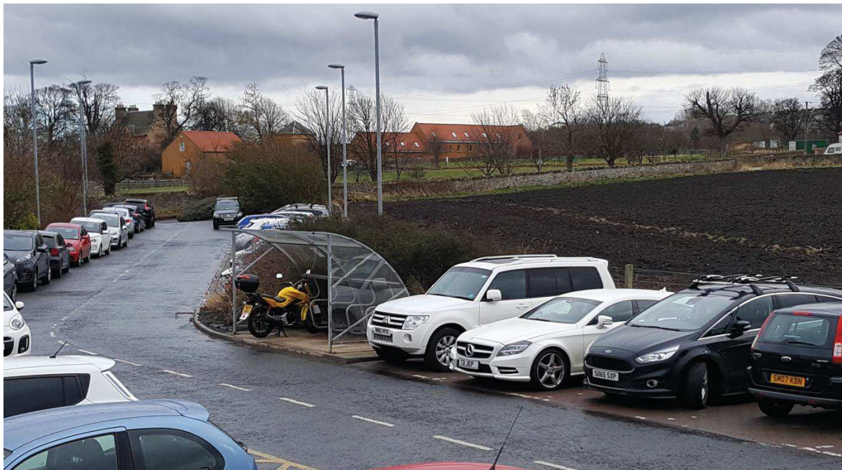
Prestonpans - Down side car park looking north toward entrance and road to Tranent