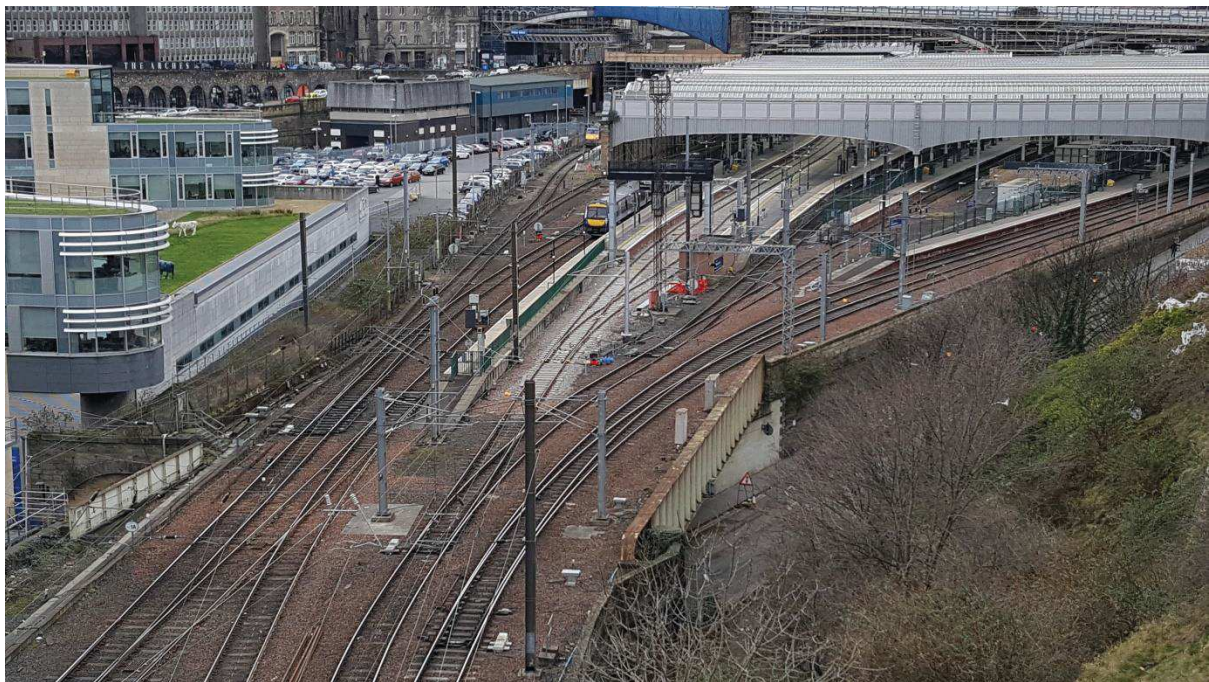
Edinburgh Waverley – General View of the East end throat showing the constrained space available.

An early assessment of the options to increase the width of No 7 platform to permit its use to its full length could be an early relatively low cost option to progress, permitting the operation of 8 car peak trains to and from North Berwick.