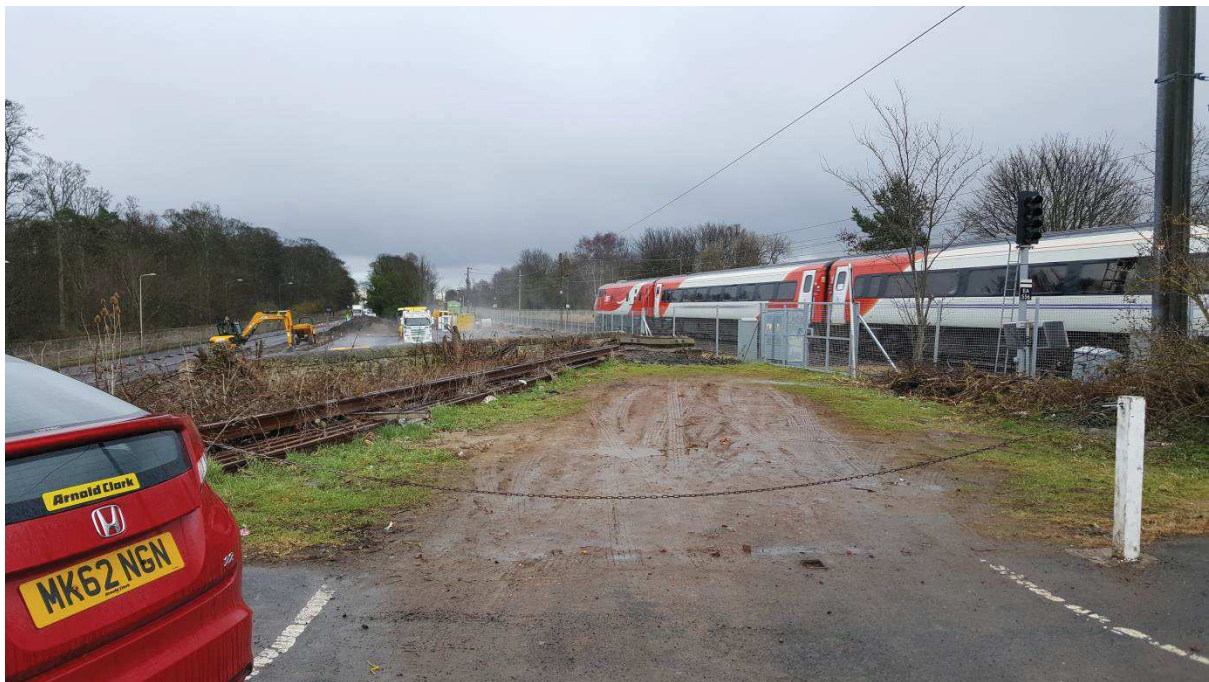
Longniddry - New Up side car park under construction from the existing car park

There could also be possible sites on the south side as part of the new housing (c 459) shown as site PS1 in the LDP, which (para 2.55 page 28) includes reference to additional car parking and active travel access to the station.