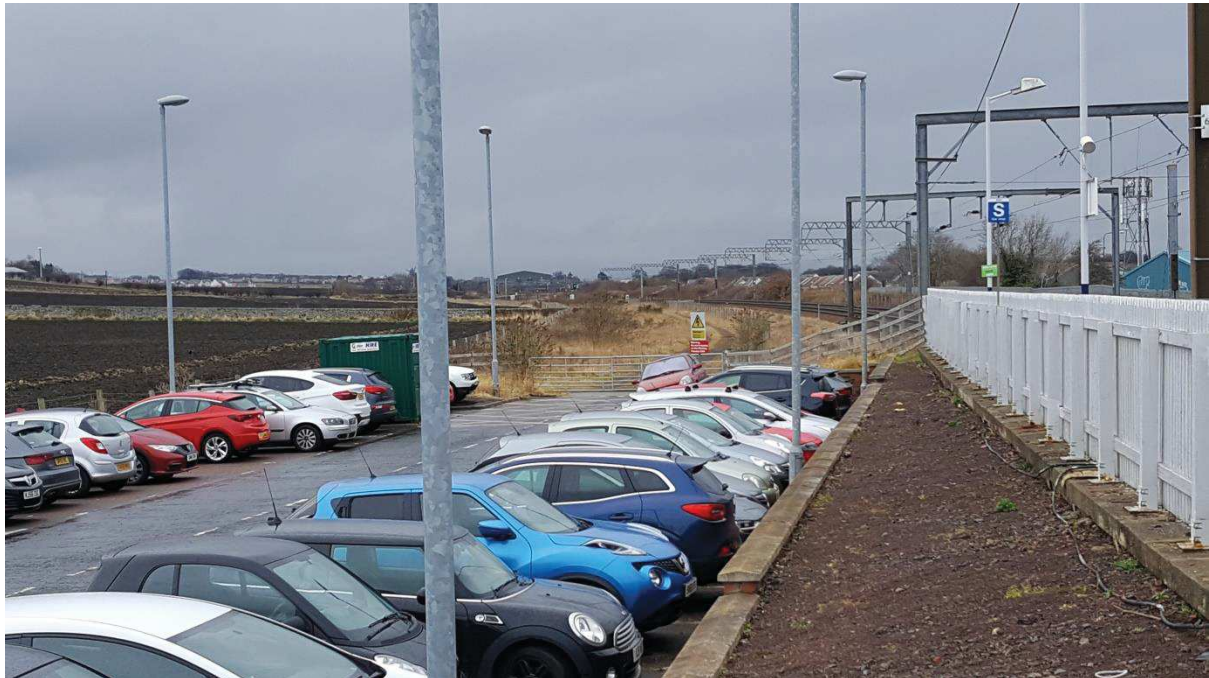
Prestonpans - Down side car park looking west

However, the access road to this car park, including from Tranent, is narrow and has severe bends.