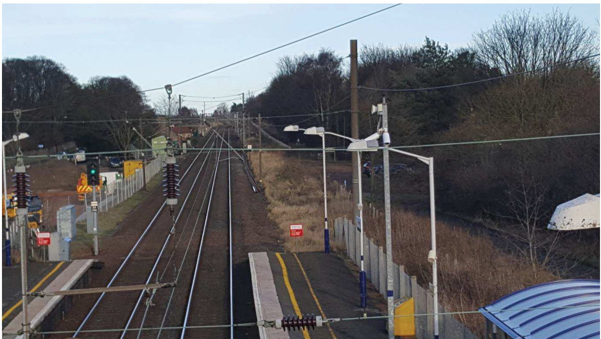
Longniddry Station – North Berwick end showing straight track and up line signal and new car park under construction on the up side, which might be a constraint on the width for any up platform extension beyond the existing signal.