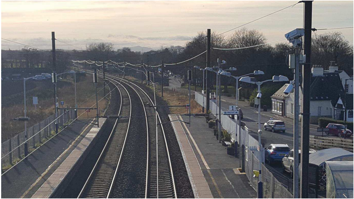
Longniddry Station – Edinburgh end – showing curve (which starts in the platform), no signalling equipment and sufficient land available.