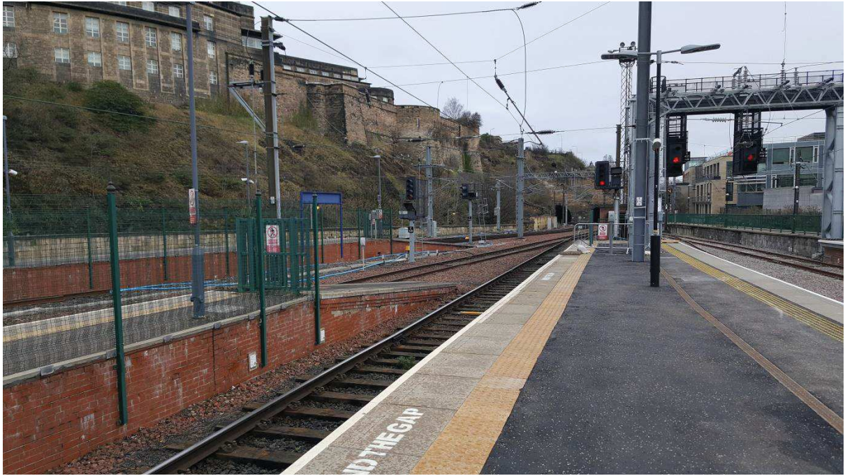
Edinburgh Waverley – Showing the constraints at the country end of platforms 3, 4, 5 & 6.