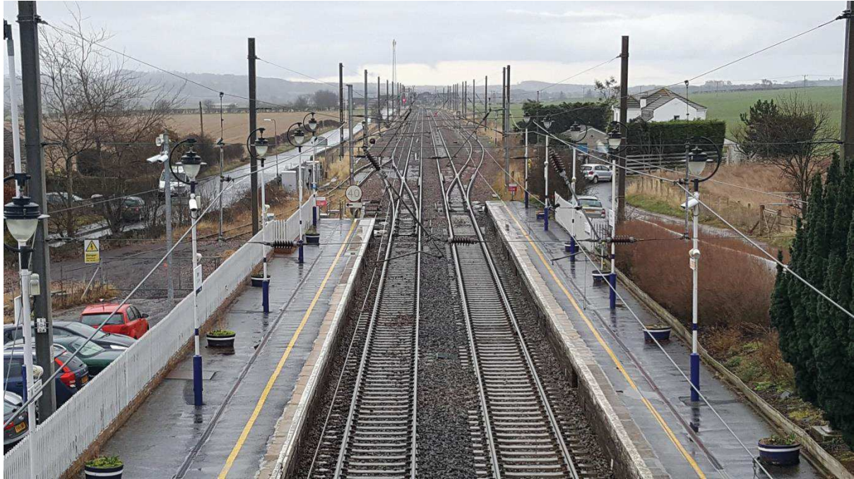
Drem – General view of North Berwick end on the station

The point work for the up and down loops is located right at the ends of the platforms which prevents significant extension of the existing platforms.