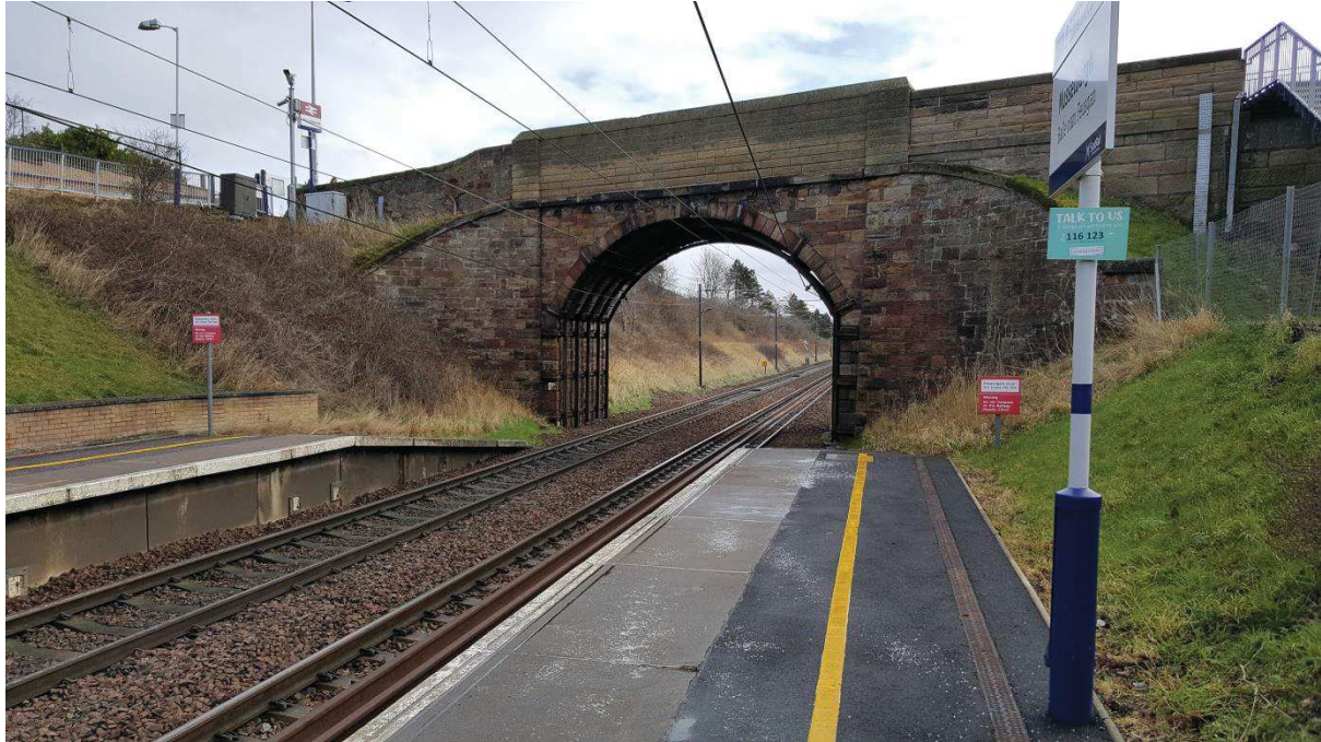
Musselburgh- North Berwick end of the platforms showing the road overbridge

Extension is limited to about 10 metres at this end of the station due to the overbridge. It would not be possible to create sufficient new platform to cater for 6 car 23m long vehicles solely by lengthening at this end. Consequently all platform extension is recommended to take place at the Edinburgh end.