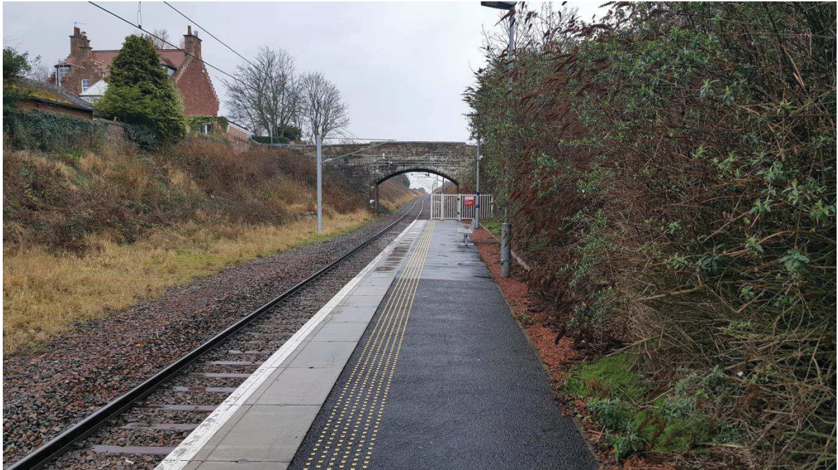
North Berwick – Ware Road bridge – general view