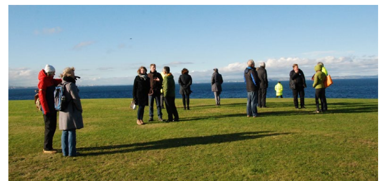
Front Cover image: Esther Cohen http://tantallonstudios.com/esther-cohen/