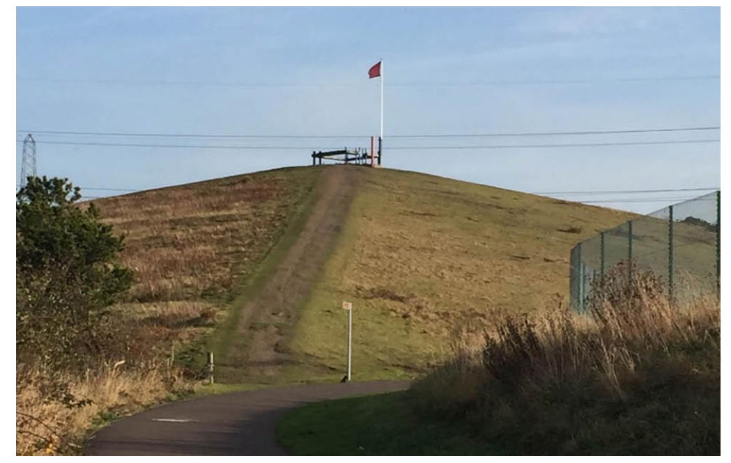
The former Cockenzie Power Station and surrounding area