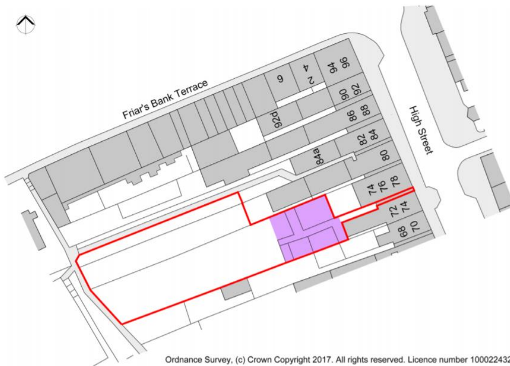
Fig 2. Black Bull Close, Dunbar High Street