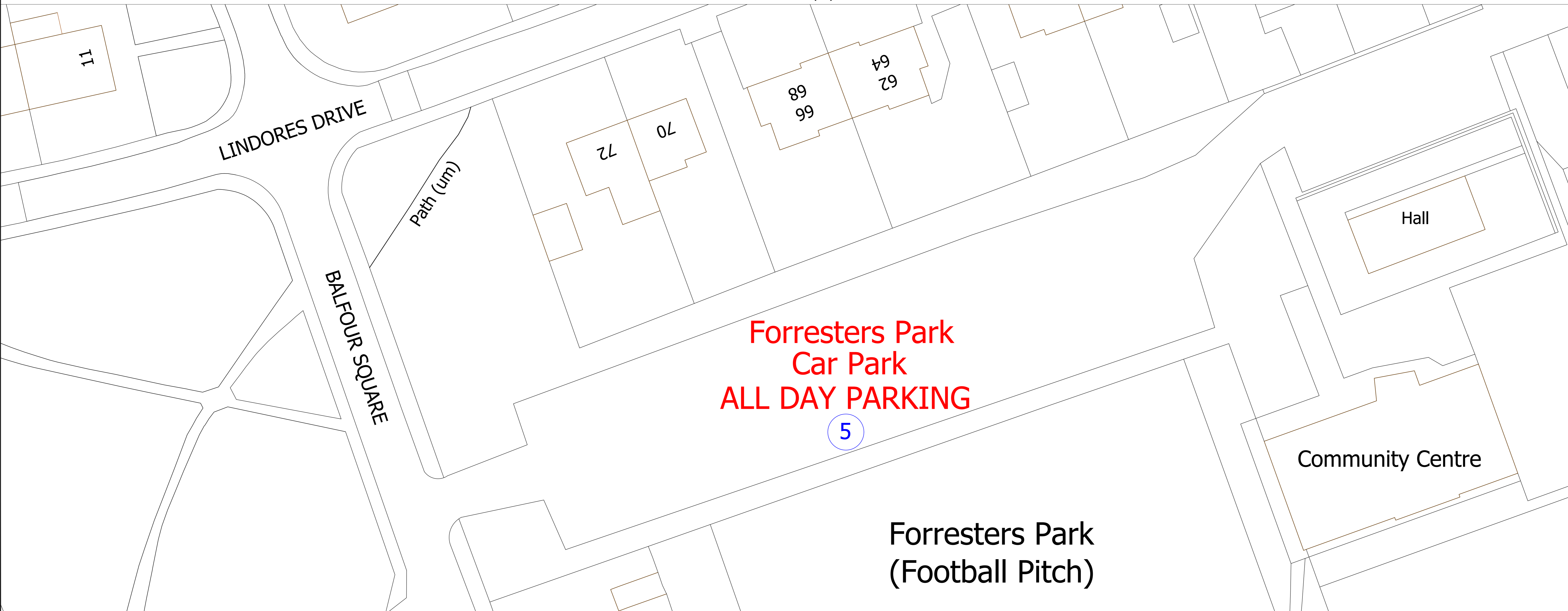
TRANENT - SPACES FOR PEOPLE 1:200 (A0)