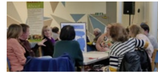
ELTRP Anti-Social Behaviour Consultation Event, March 2023

ELTRP and local tenants' and residents' groups in East Lothian have received recognition for their work both locally through ELTRP Awards and nationally.