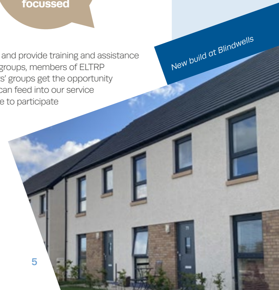
New build at Blindwells

We will assist tenants to participate with us and provide support and resources to enable them to attend meetings and events.