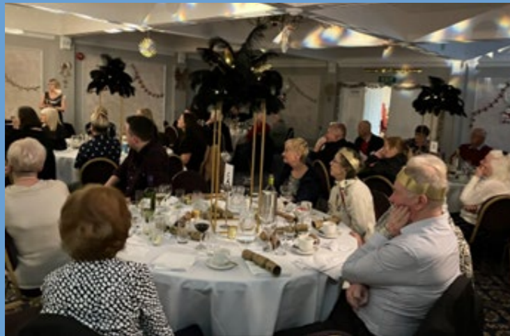
East Lothian Tenants & Residents Sparkle Awards 2023

We will provide resources for tenant participation, give tenants time to consider proposals, involve them and give them the opportunity to influence our decision-making. We will continue to work in partnership with local tenants' and residents' groups and East Lothian Tenants and Residents Panel to further develop our tenant participation and scrutiny activities.