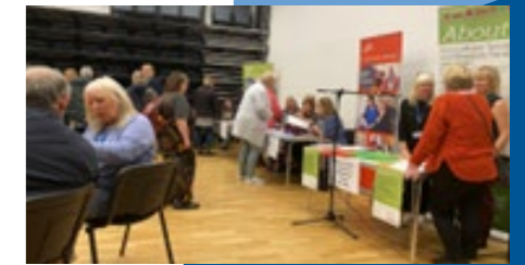
ELTRP Annual Gathering 2023