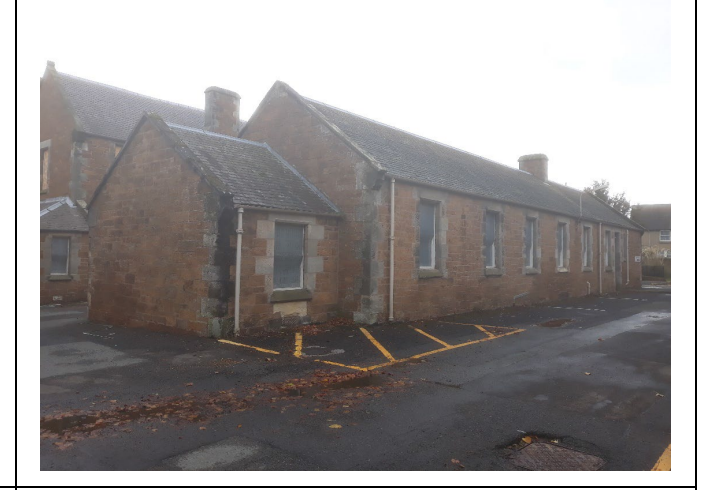
Photograph 4: Ancillary Building (BS 2)