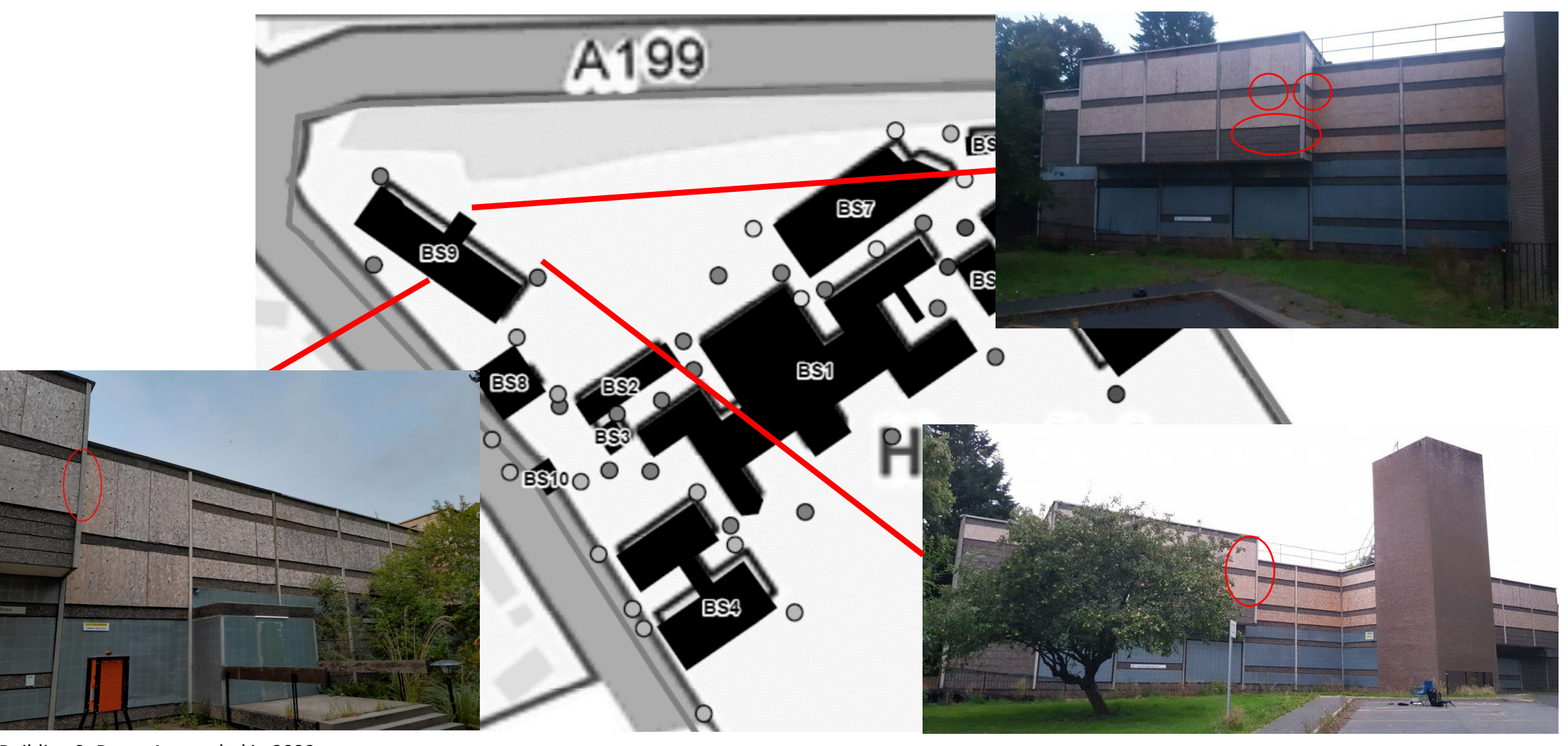
Building 9: Roost 4 recorded in 2022