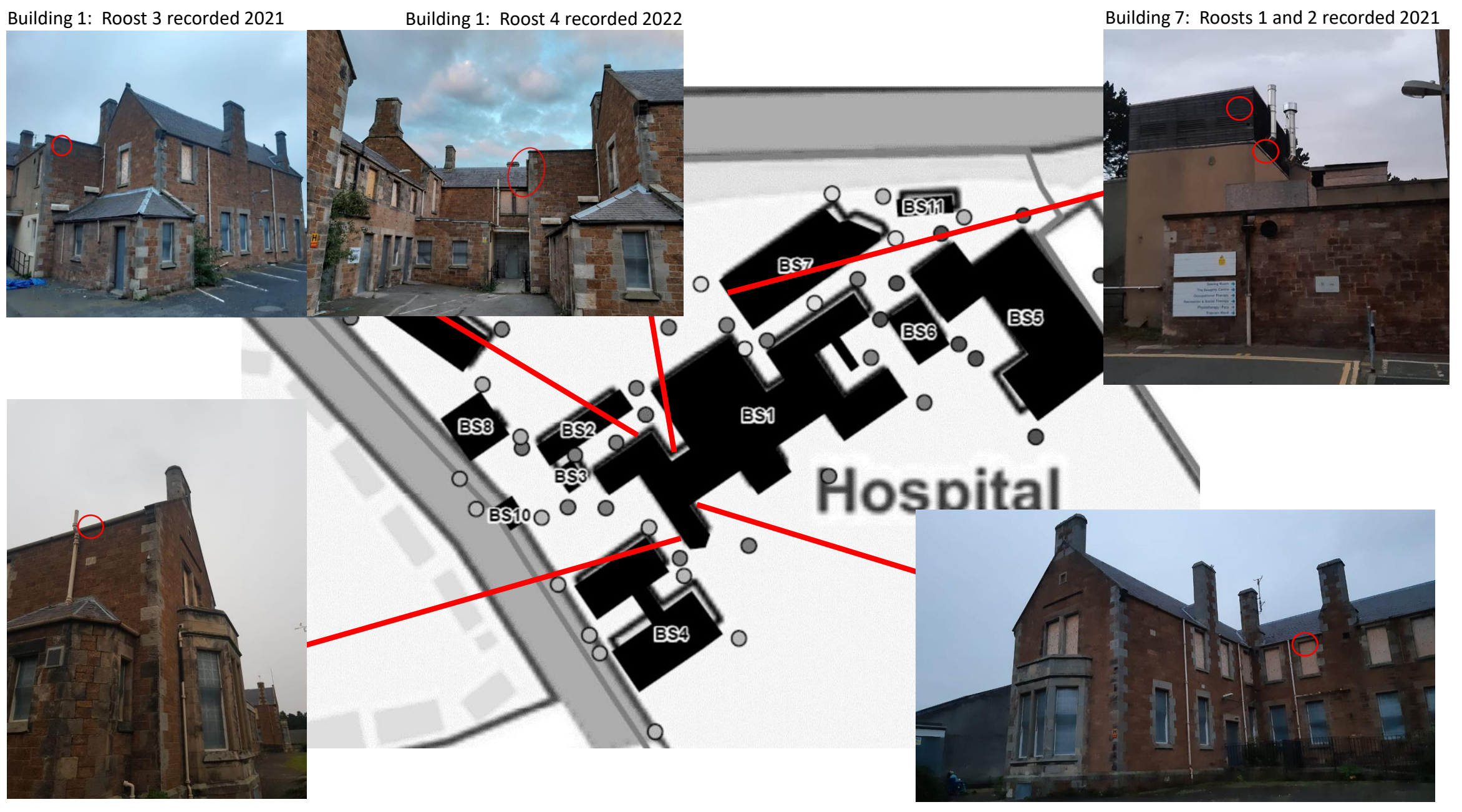
Building 1: Roost 2 recorded in 2021