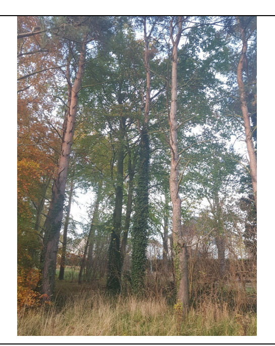
Photograph 1: Mixed woodland plantation