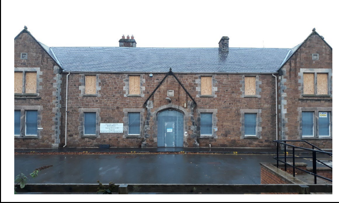
Photograph 3: Northern elevation of main building (BS 1)