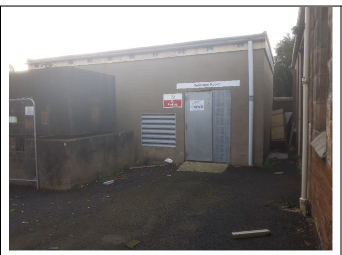
Photograph 5: Building BS 3