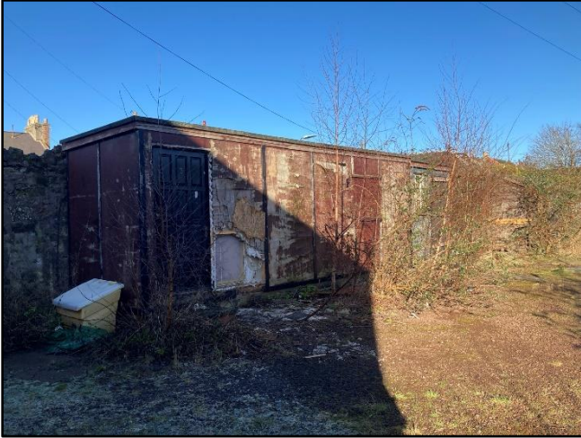
Site (Unit 3)