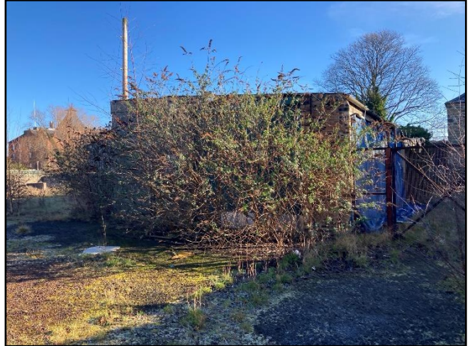
Site (Unit 7)