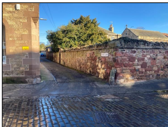
Access to Site from Church Street

Crown Copyright Reserved - OS licence ACD000824676 (2025)