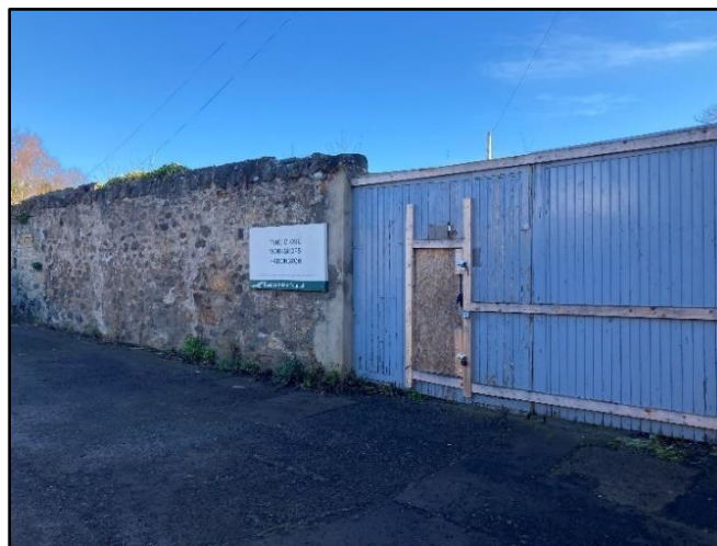
Entrance to Site