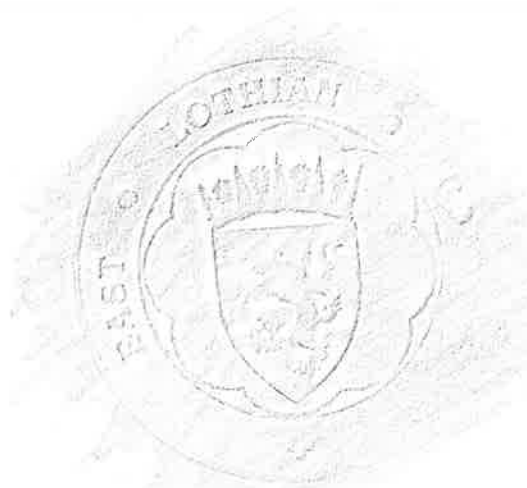
Proper Officer East Lothian Council John Muir House Haddington

In terms of Section 160(1) of the Act it appears to the Planning Authority that the requirements of Section 160 (1A) (a) and (b) of the Act are met in regard to both of the Protected Trees T1 and T2 and the making of the Order is therefore necessary for the preservation of Protected Trees T1 and T2. Accordingly, it is expedient in the interests of amenity to make the Order in relation to Protected Trees T1 and T2 and in addition, they are both of cultural and historical significance. Further and in particular, the Protected Trees T1 and T2 are important to the arboricultural heritage of Whittingehame House Garden and Designed Landscape (Reference WHITTINGEHAME GDL00385)