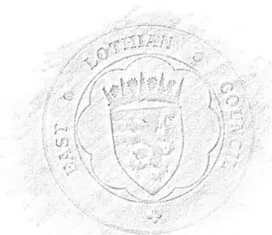
Proper Officer East Lothian Council John Muir House Haddington

This Order is sealed with the Common Seal of East Lothian Council and signed for on its behalf at Haddington on 4 March 2025.