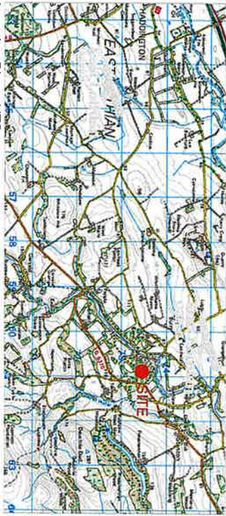
Location Plan - NTS

This base plan is reproduced from Ordnance Survey material with the permission of Ordnance Survey on behalf of the Controller of Her Majesty's Stationery Office Crown Copyright 2025. Unauthorised reproduction infringes Crown Copyright and may lead to prosecution or civil proceedings. East Lothian Council AC0000824576