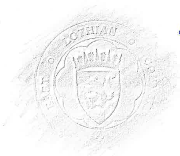
Proper Officer East Lothian Council John Muir House Haddington