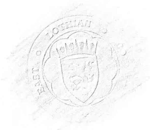
Proper Officer East Lothian Council John Muir House Haddington