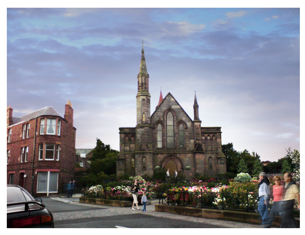
Proposed Renovation & Conversion