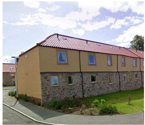
Figure 3.3a Residential & Business Development, Old Limekilns, East Saltoun