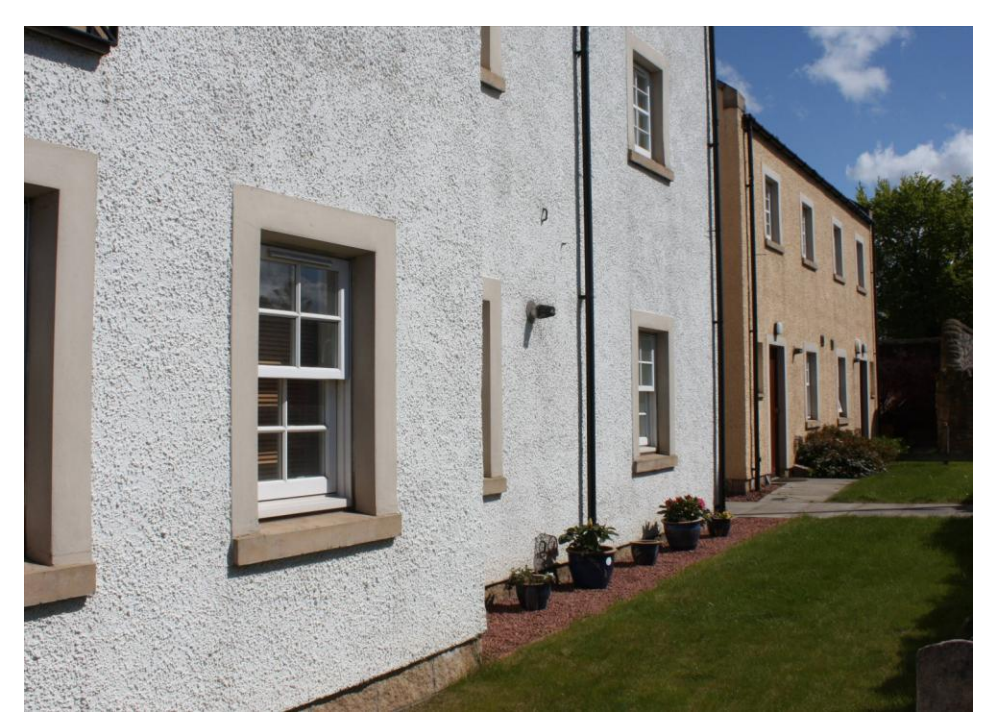
Modern build with traditional harl finish