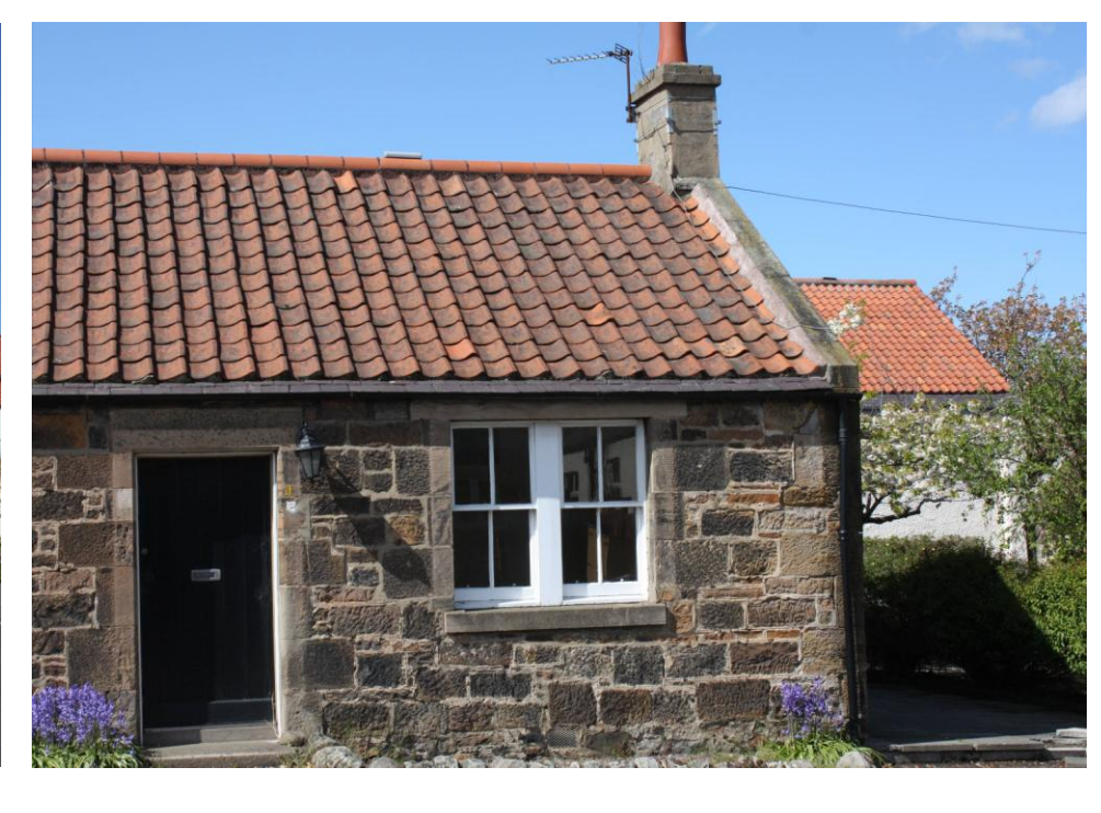
Natural stone / traditional pantiles