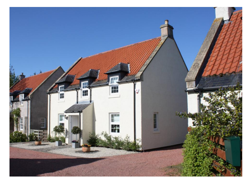
Modern & traditional styles combined