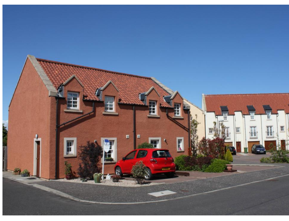
Modern build with traditional harl finish