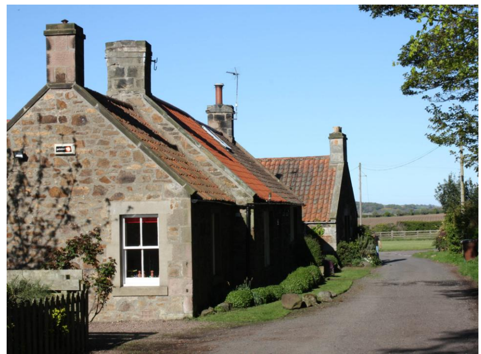
Traditional stone gable