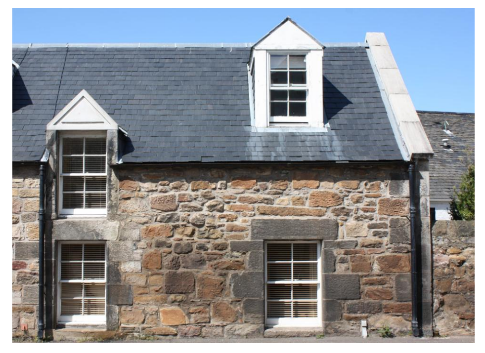
Slate roof / natural stone