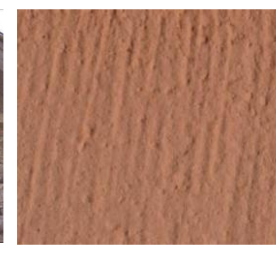
Housing Design in East Lothian - Old & Modern