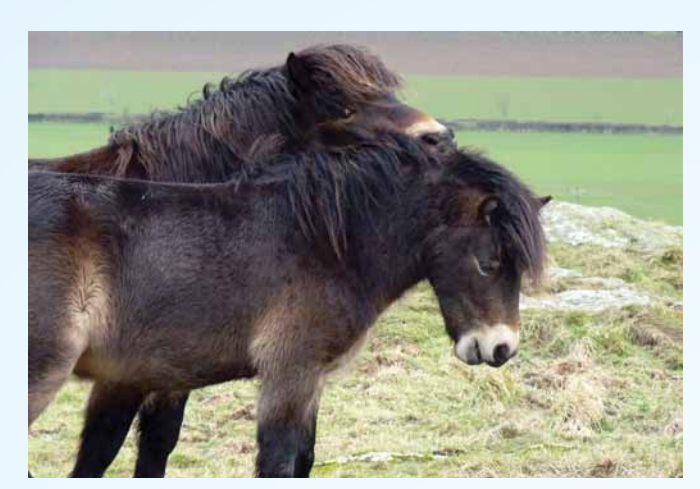
North Berwick ponies

On October 2013, seven Exmoor Ponies were delivered onto the site. Additional volunteer recruitment was achieved locally to ensure that the animals were able to receive daily welfare checks. Unfortunately in January 2014 one of the ponies died in an unspecified incident. Following a review of the circumstantial evidence, however, the grazier was happy to let the remaining ponies to remain on site, since when they have been grazing without any further incident.