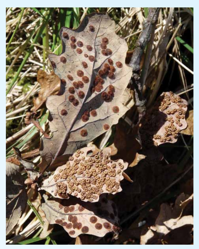
Common and silk-button spangle galls

Collectively these are termed 'ecosystem services' . A decline in biodiversity is a decline in these ecosystem services. The cost would be prohibitively high if the services