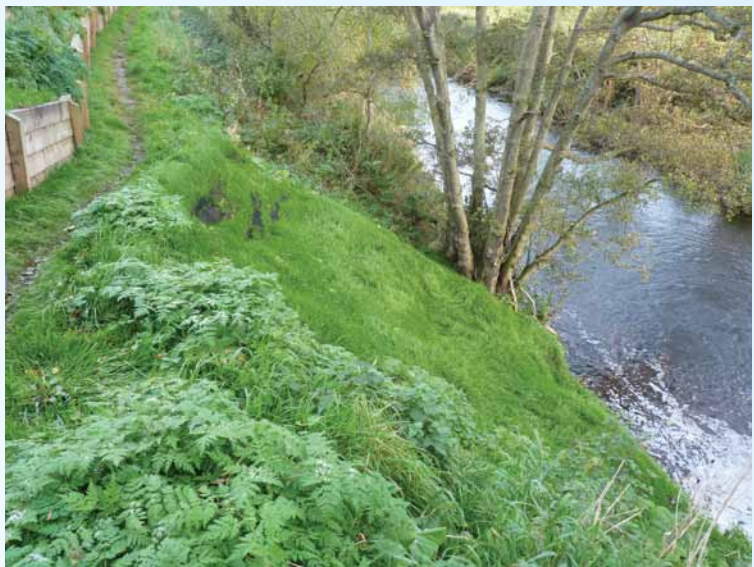
'Soft' engineering bank repair

A people counter was installed on the River Tyne Path at Sandy's Mill in February 2014.