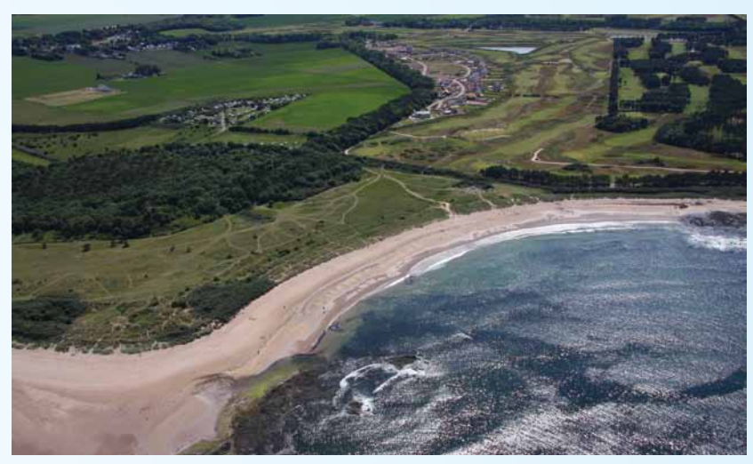
Yellowcraig and Archerfield

6.5.1 The stretch of coast from Gullane to Broad Sands was notified as a Site of Special Scientific Interest (SSSI) in 1967 and was subsequently incorporated into the Firth of Forth SSSI in 2001. The Firth of Forth itself is a Special Protected Area (SPA) and a Ramsar site as a result of the nature of its birdlife and wetland habitat.