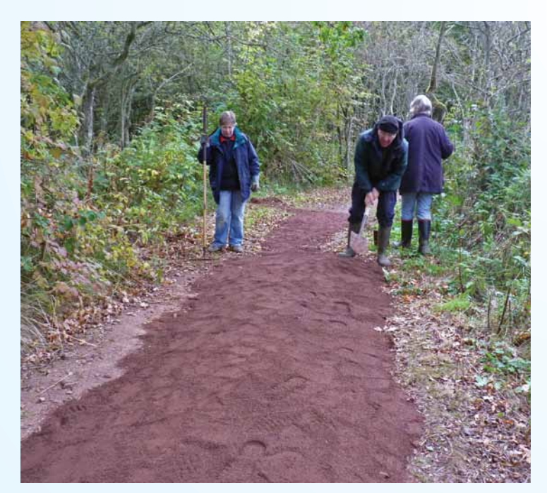
Path warden team task at Amisfield

The Countryside Officer coordinates the recruitment and training of the path wardens and maintains a record of their work. Additionally he organises monthly team tasks where volunteers can undertake larger projects. This also provides an opportunity for