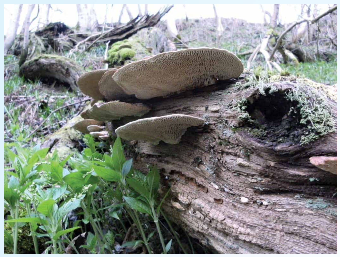
Dead wood is an important habitat

The Scottish Government produced guidance for local authorities on the designation of Local Biodiversity Sites (LBS). East Lothian Council first incorporated such sites into the 2008 Local Plan (then called Wildlife Sites) along with policies to protect their biodiversity interest from inappropriate development. Local Biodiversity Site boundaries have been reviewed in advance of the forthcoming Local Development Plan.