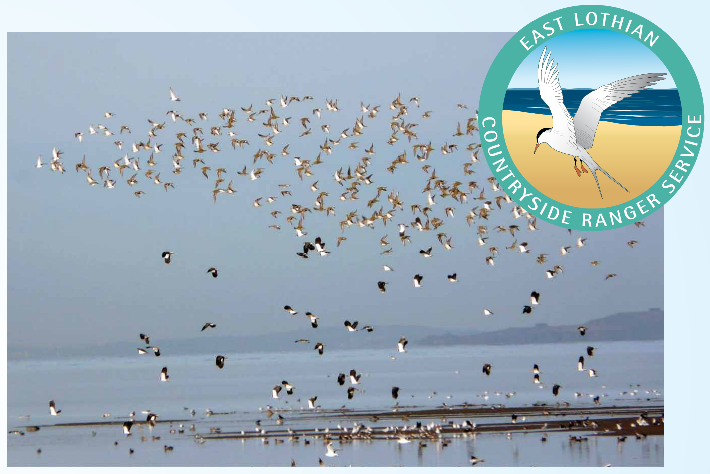
Golden plover and lapwing flock