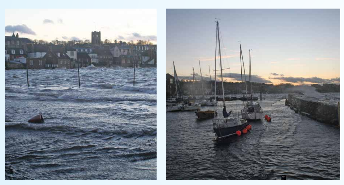
Tidal surge in North Berwick

Winter saw a relentless succession of strong but mild low pressure weather systems run in off the Atlantic from early December (this month was the wettest on record for Scotland) until mid-February. On the 5th December a tidal surge caused extensive modification of the coastline. Over the entire winter period there were less than 10 frost days recorded and no snow lay at lower levels.