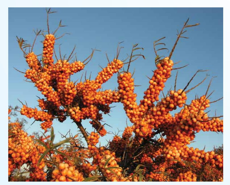
Sea buckthorn berries

Across all sites, regenerating shoots continued to be controlled by a combination of herbicide application