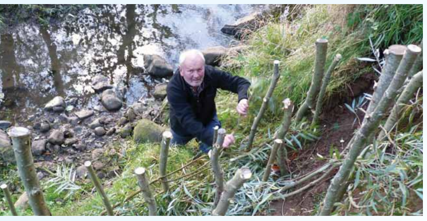
Building willow sets to prevent bank erosion

4.2.1 Volunteers continued to provide a fundamental role in the progression of countryside projects and in the maintenance of site infrastructure. Their assistance is summarised below;