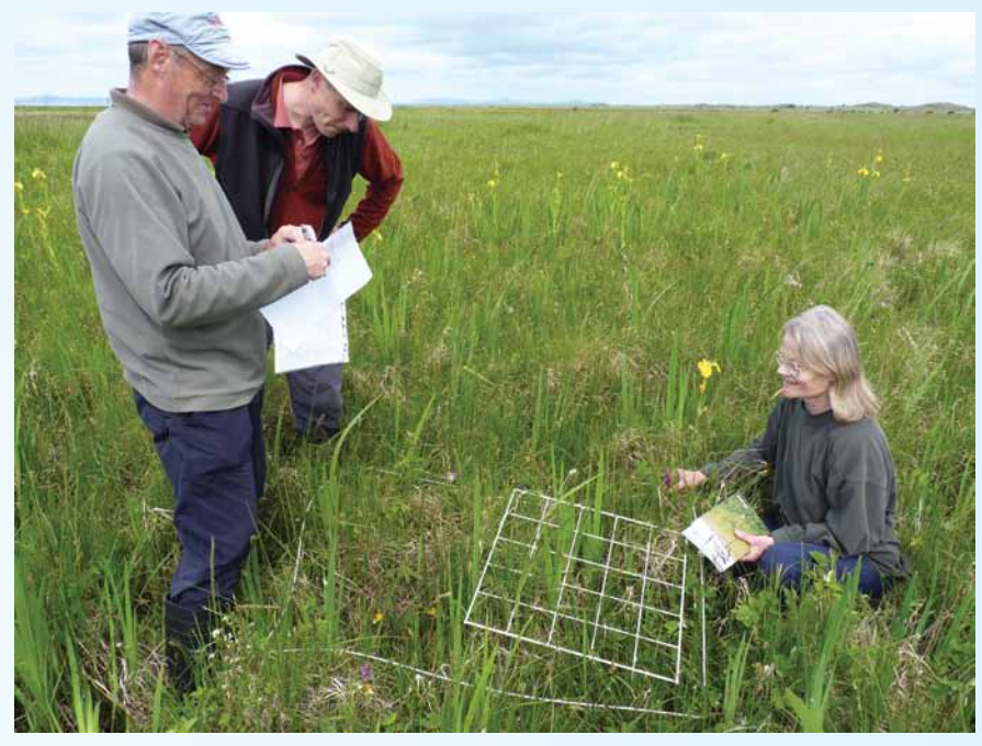
Botanical surveying at Aberlady

and Barns Ness). Bumblebee surveyors walked transects at each site on a 1 / month basis and recorded the different species and sexes of species they encountered. The botanical surveyors conducted quadrat surveys at the sites in order to establish a base-line population of key indicator species.