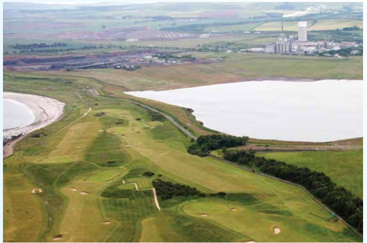
North West Quarry development

6.6.3 The RSPB case officer developed a feasibility study to identify and evaluate a range of habitat creation and restoration opportunities for the area. Visitor potential and access facilities compatible with a conservation end-use were assessed. The study set out a number of habitat creation/restoration options for the site based on site ecology, resource constraints, legal framework and quarry operational requirements. For a full copy see Appendix C.