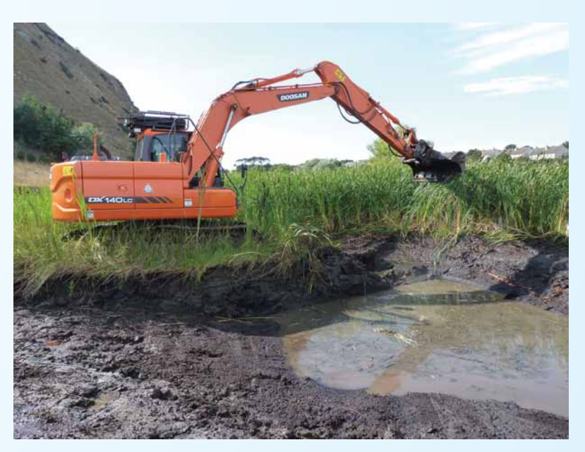
programme of gorse control,

During 2013 a fourth site North Berwick Law, was prepared to receive grazing stock. Funding for this work was made possible by the receipt of £24,190.00 grant aid in the form of funding from the Scottish Rural Development Programme (SRDP). The money enabled the erection of stock fencing, together with associated gates and stiles. In addition funding was secured to undertake a large-scale