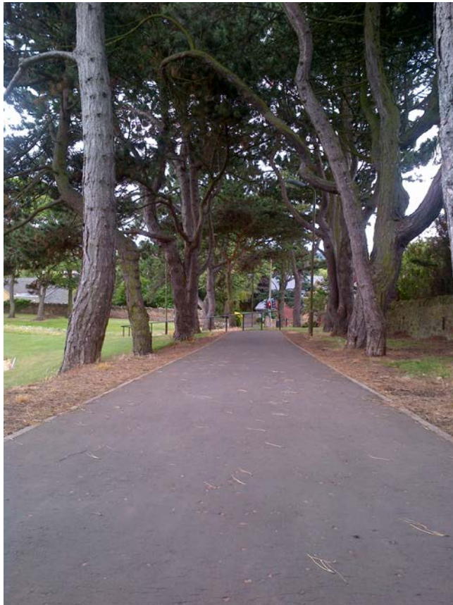
Footpath between trees