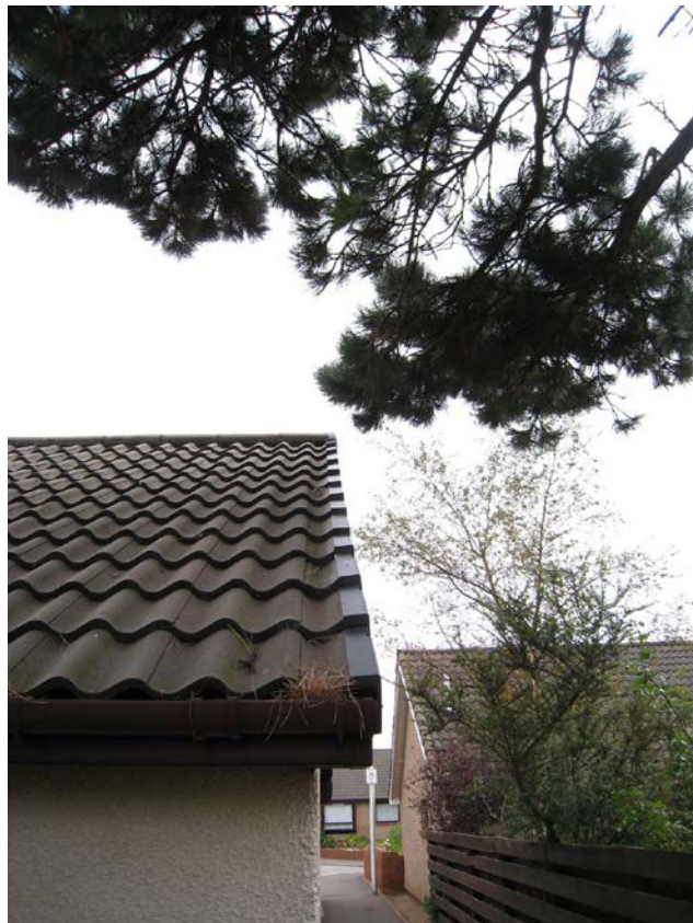
2 Letham Park garage roof