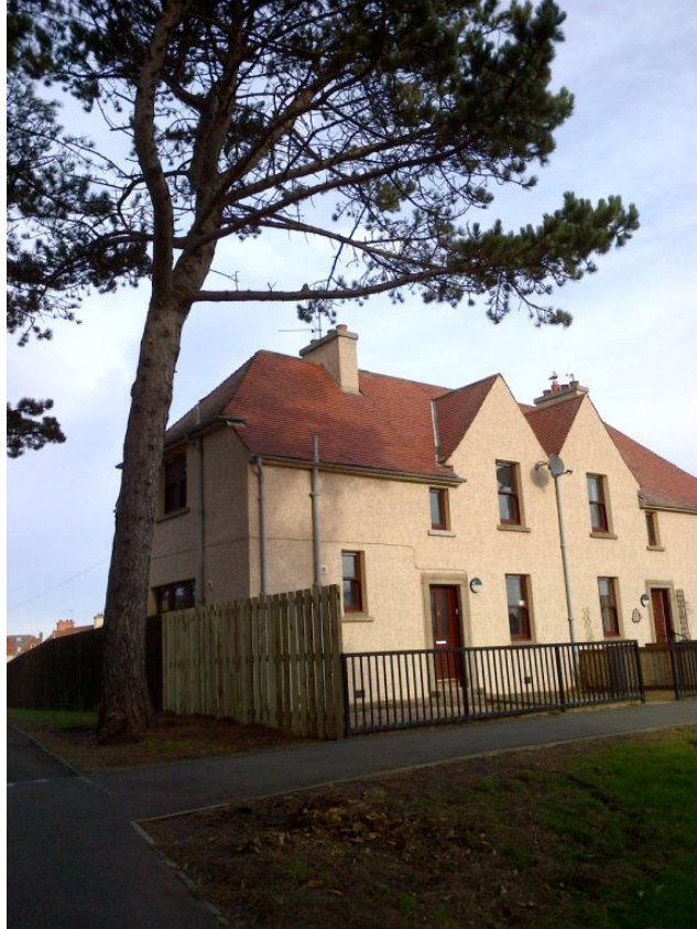
Parsonspool looking at 64 Parsonspool