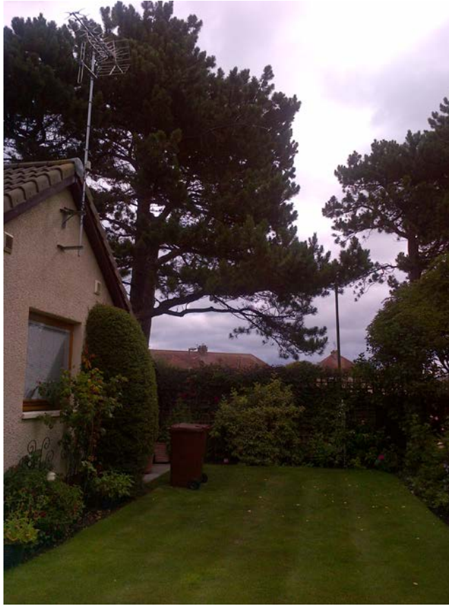
Trees viewed from 2 Letham Park