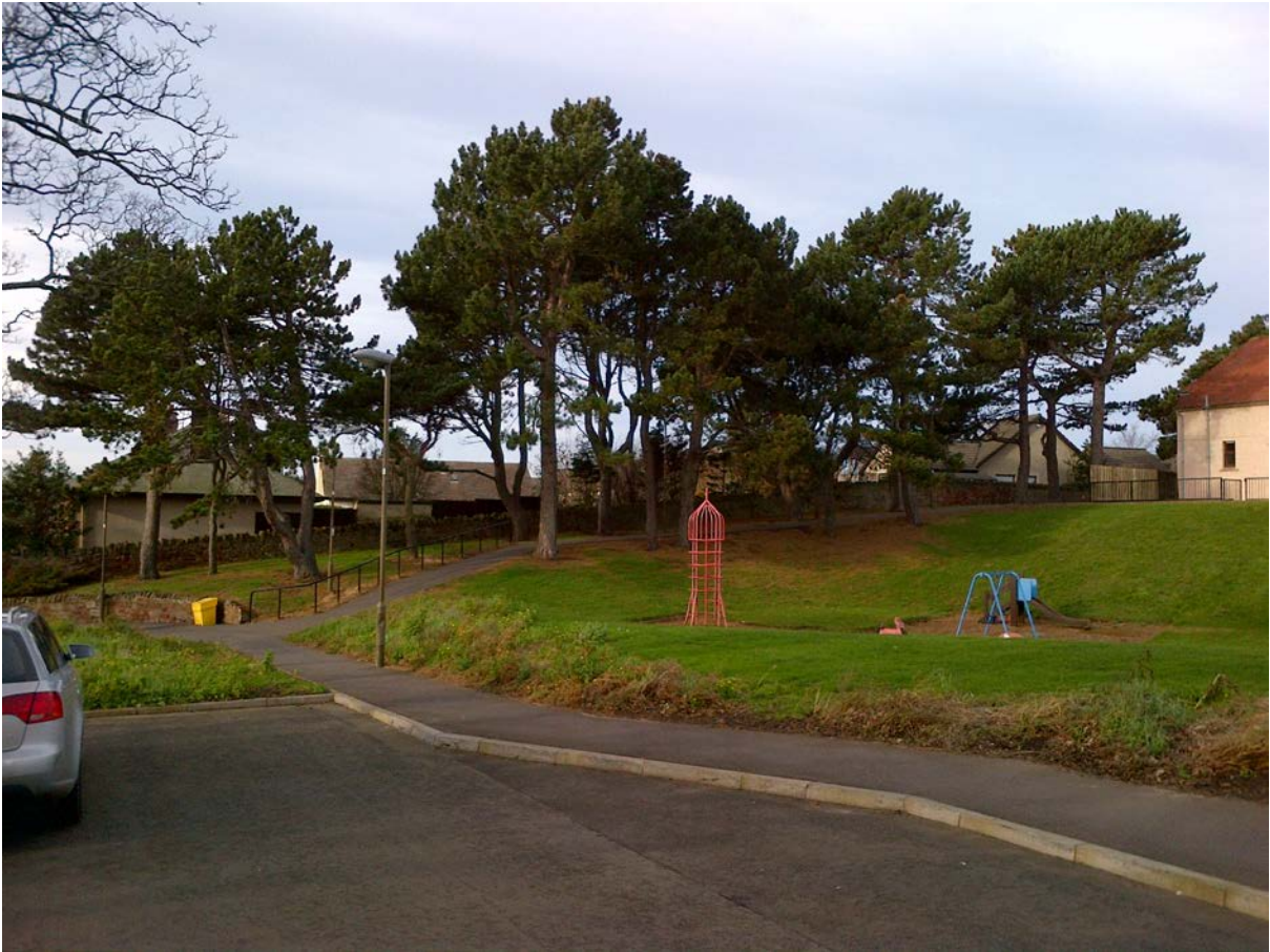
Parsonspool looking west towards trees.