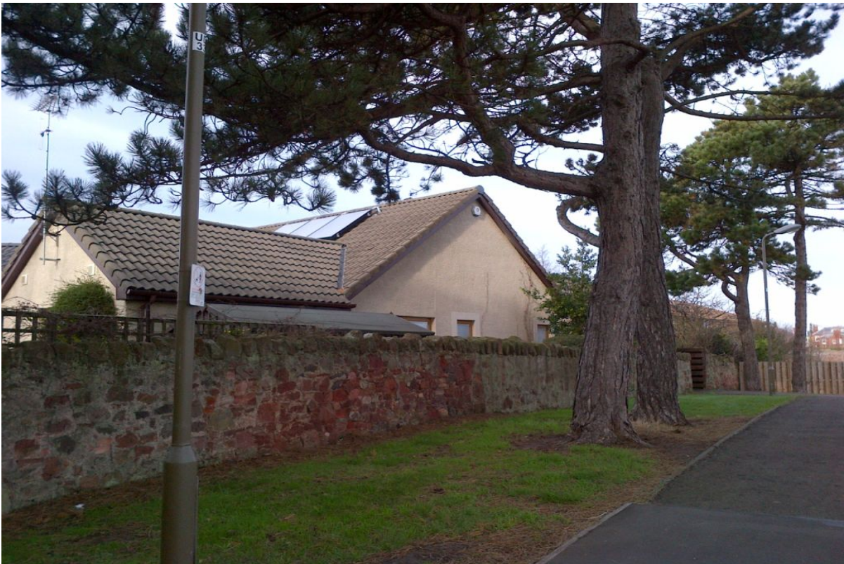
Parsonspool looking west at 2 Letham Park