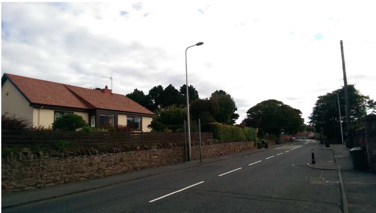
Belhaven Road looking west towards trees.