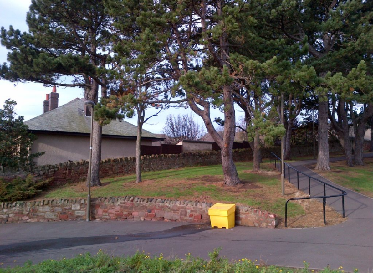
Parsonspool looking west at 2 Belhaven Road