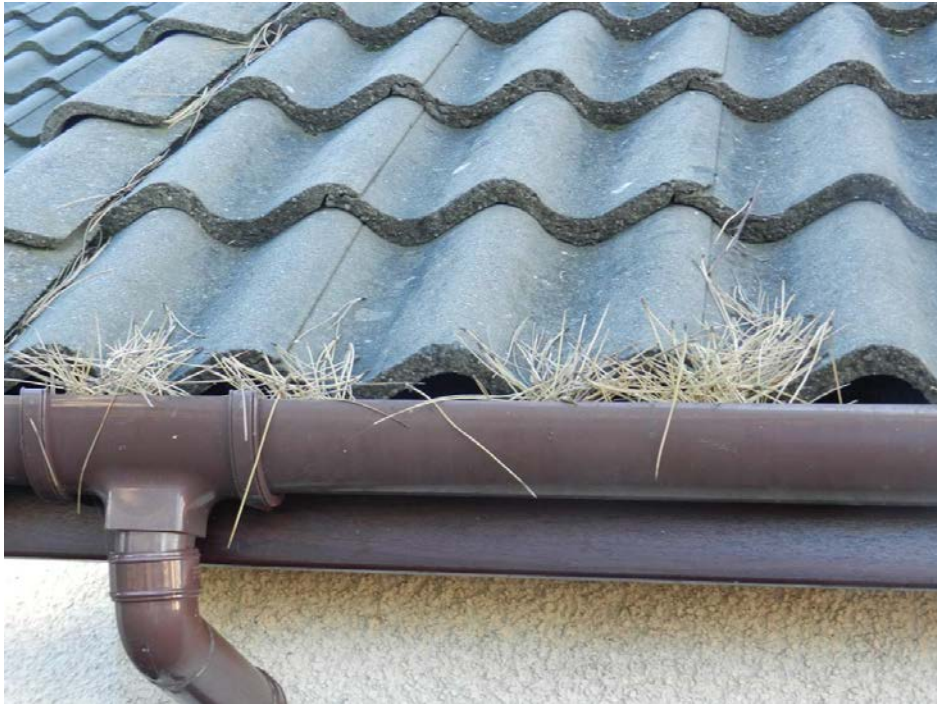
2 Letham Park roof