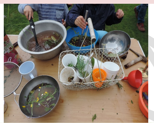
When children play they naturally seek out elements of risk, challenge and adventure . Encountering risk and challenge through play helps children to build resilience, exercise judgement and develop confidence.

Play contributes to all aspects of learning: through play children learn by doing; they explore and engage with the world around them; they experiment with new ideas, roles and experiences and develop problem solving skills. High quality play experiences are the basis of young children's learning and are key to closing the attainment gap between children.