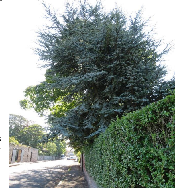
Tree T3 Blue cedar

Mature oak, beech and horse chestnut of Group G5