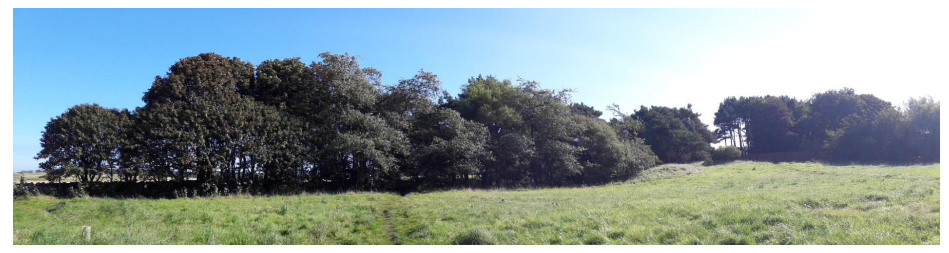
View of woodland W1 from the open ground to the west visually linking with the trees of TPO43 and sycamores of group G1 to the right-hand side