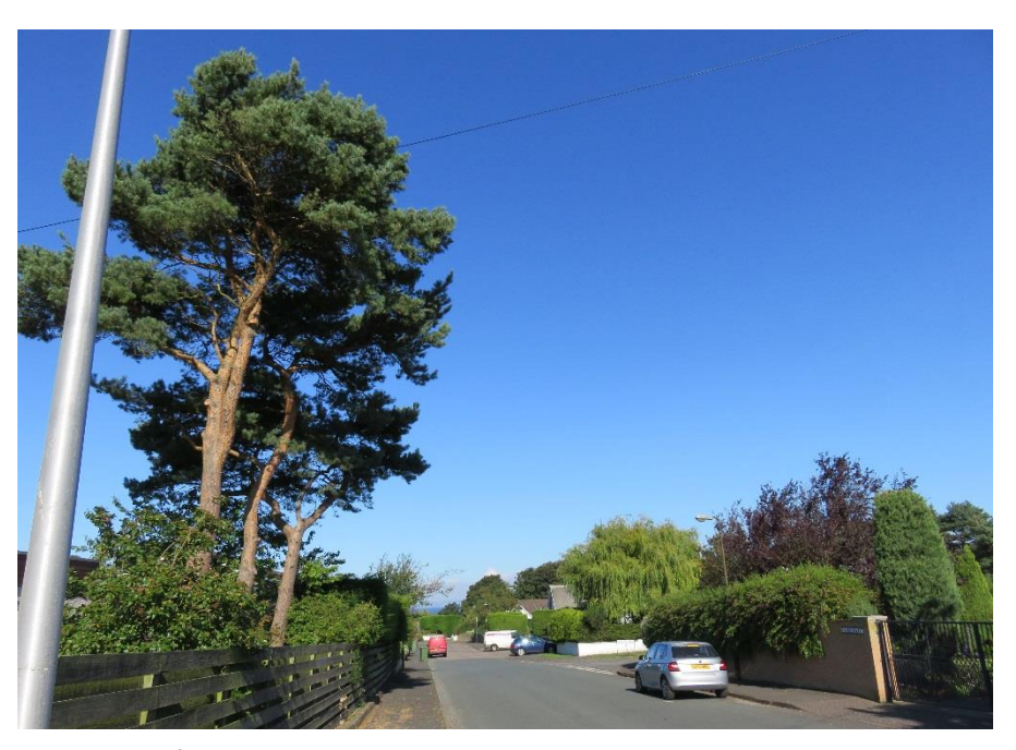
View north from Broadgait along Erskine Road showing visual link between the pines of group G4 with the sycamores of group G1 and the trees of TPO42 in the distance