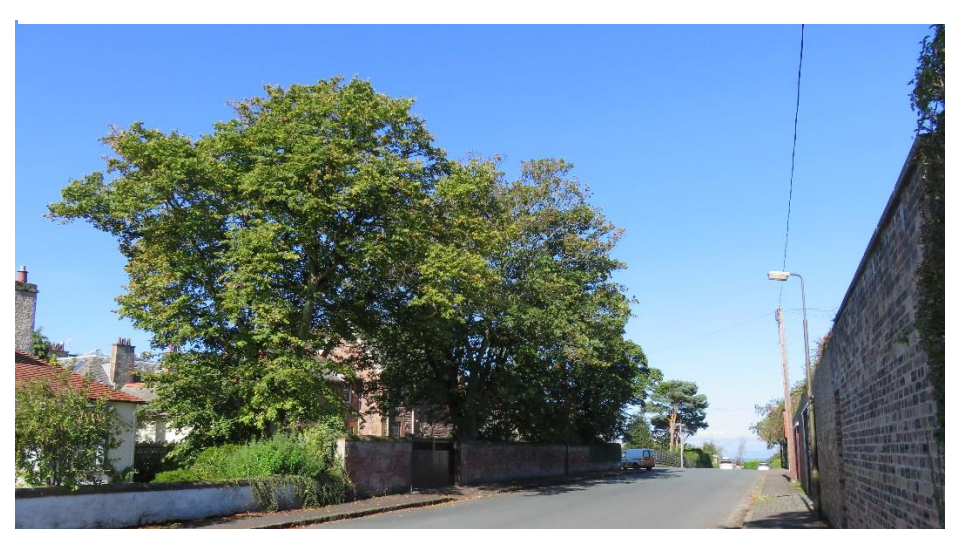
Trees T6-T3 of this TPO reading with the pines in group G4 of TPO further along the street