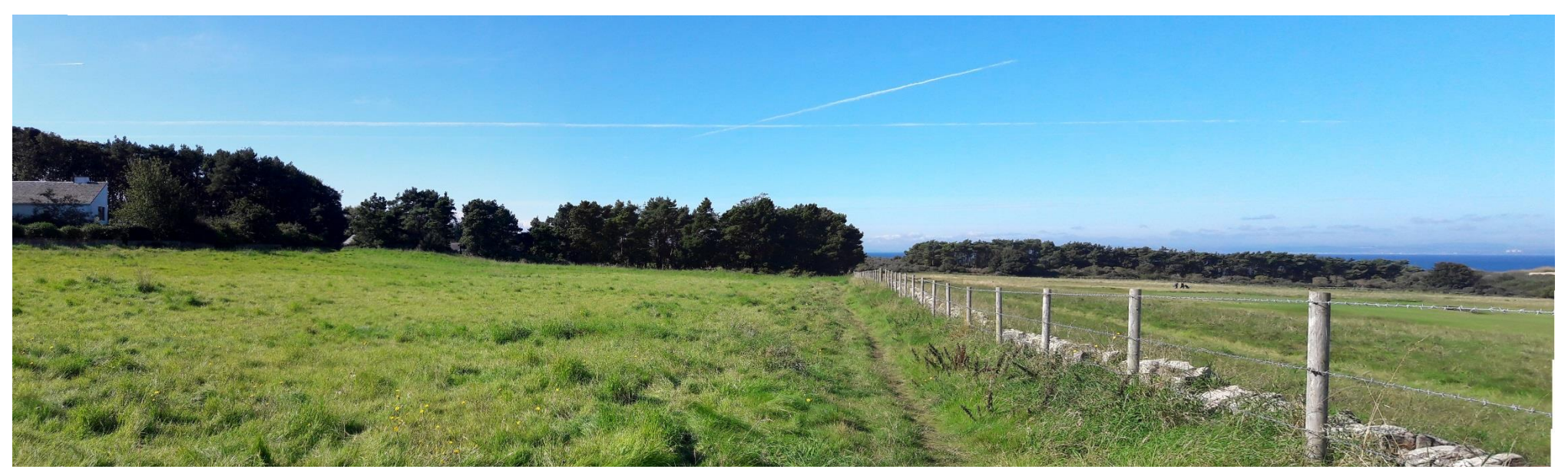
View from the edge of Muirfield Golf Course to the east with the trees of woodland W1 in the centre of the view visually linking the trees of TPO43 to left-hand side with trees within Gullane links to the right-hand side