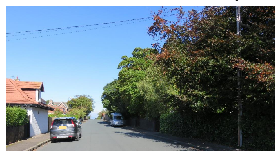
View north along Broadgait with trees of TPO135 at Craigour to the right-hand side linking visually with trees T6-T3 of this TPO in the distance on the left-hand side