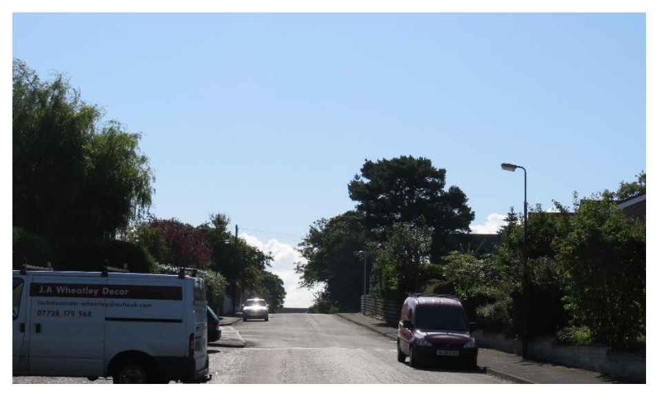
View south along Erskine Road with pines of group G4 and trees T3-T6 on the right-hand side linking visually with the with trees of TPO135 at Craigour to the left-hand side in the distance