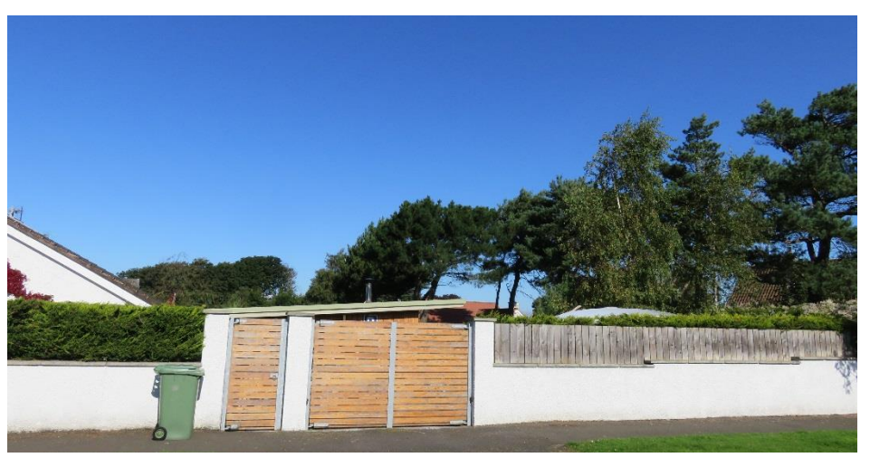
View north from Muirfield Park over rear gardens showing visibility of the pine trees T1 and T2 and groups G3 and G4 together with the trees of TPO42 to the left and the council owned trees to the right