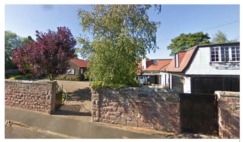
More open aspect to Nisbet Road – Kilbruach & Madras Lodge.