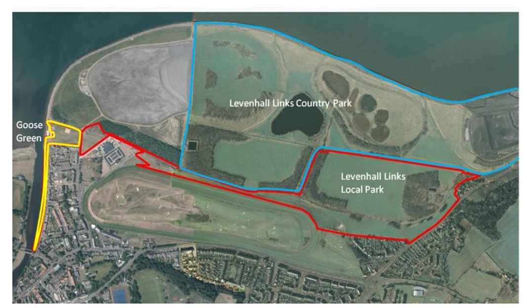
With regard to the open space function of the site, the area of sports pitches at the south eastern corner of the site, the BMX track to the west and connecting path corridor have been classified as the Levenhall Links Local Park (refer to the map).