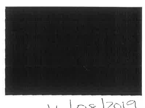
East Lothian Council Licensing 1 9 AUG 2019 Received