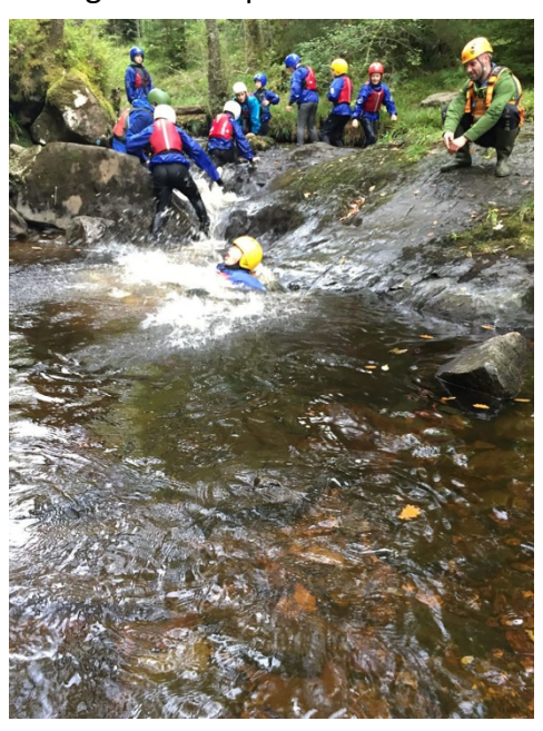
Lothian - Ben More, Lagganlia, York.

both good examples of collaborative cluster initiatives which not only give our children