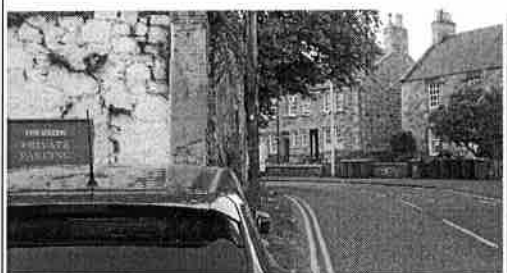
Restricted visibility to north

My particular concerns are for the safety of customers and staff entering and leaving the site across a busy road. There is no pavement on that side of the road in either direction. Visibility of on-coming traffic from the north is very restricted by the bend in the road (see photos below). Customers will need to cross the road to the main pub building to access toilets and to leave the beer garden. Staff will need to cross the road frequently when delivering food from the kitchens to the tables. If children are present then there is no gate restricting access to the road. It is obvious that customers arriving from, or departing to, Station Road will not cross the road at the exit, walk down the pavement and cross again at the lights; they will walk down the road on west side where there is no pavement. This would be particularly dangerous after a few beers.