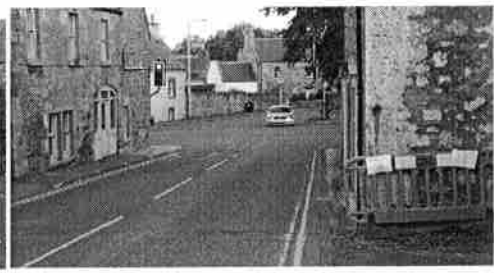
Absence of pavement to south for access to Station Road

Please attach supporting documents/further pages as necessary. Please number all extra pages