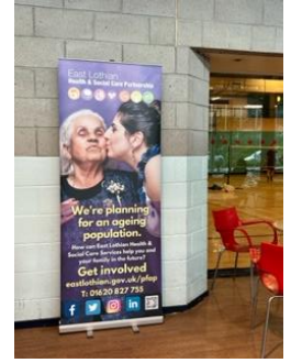
North Berwick Sports Centre