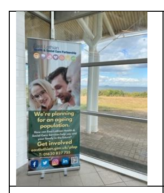
Dunbar Leisure Pool