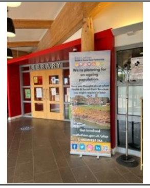
Bleachingfield Centre, Dunbar