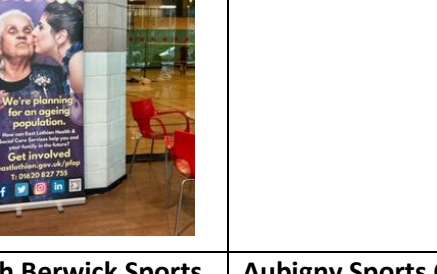
Aubigny Sports Centre, Haddington