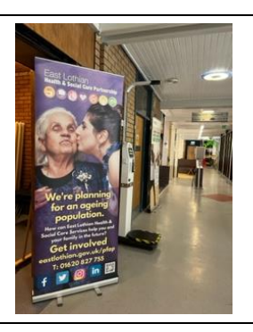
Loch Centre, Tranent