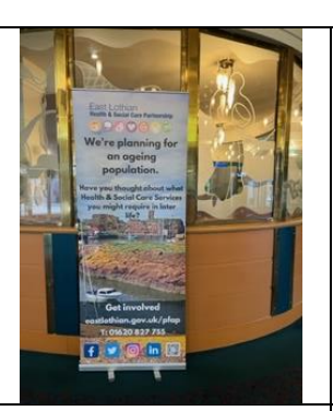
Brunton Hall, Musselburgh