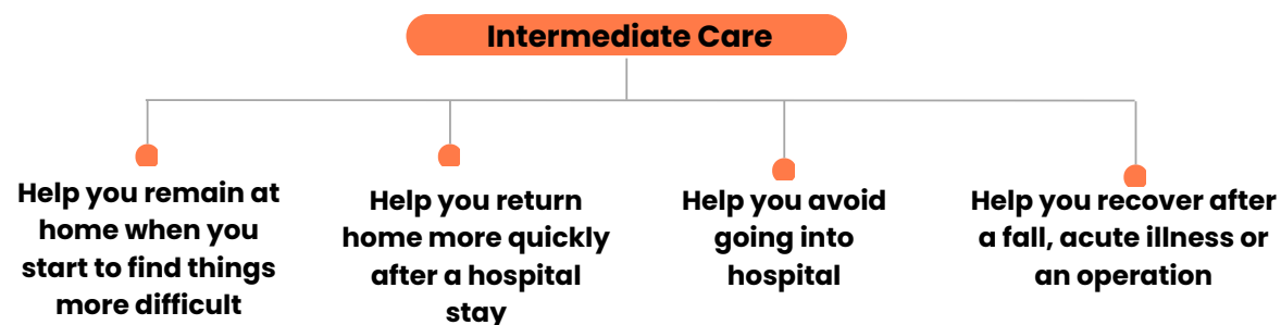
Diagram 3. The Four Key Principles of Intermediate Care from NICE Guidelines, 2018

There are three main aims of intermediate care and they are to: –