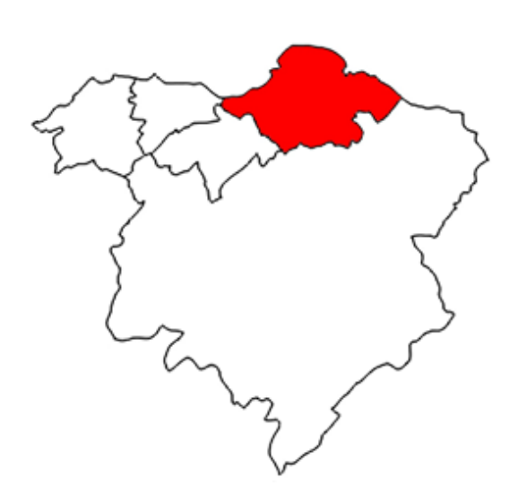
Policy Development and Scrutiny Panel