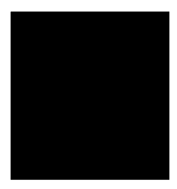
26th September 2023