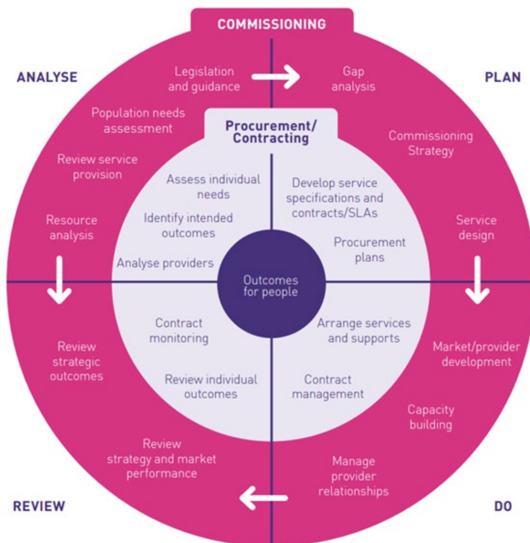
Figure 4 - Commissioning cycle diagram