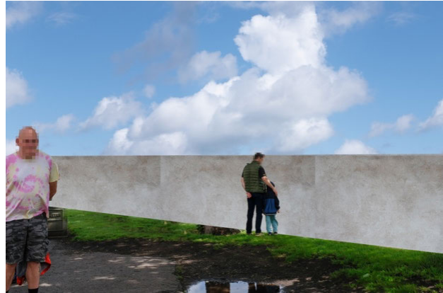
Example of Loretto Corner – 1.8 metre wall!!